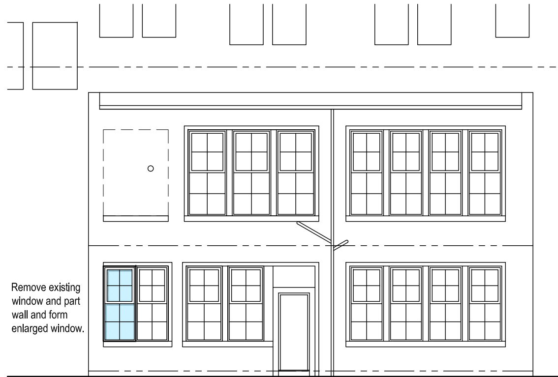
North-West Elevation [from Annandale Street Lane] [1:100]