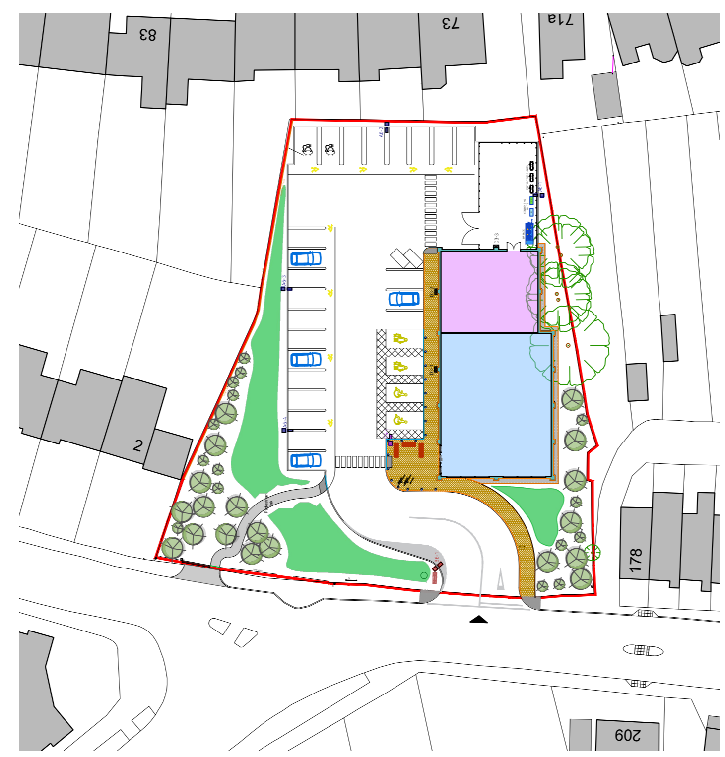
3 SITE PLAN 1:500