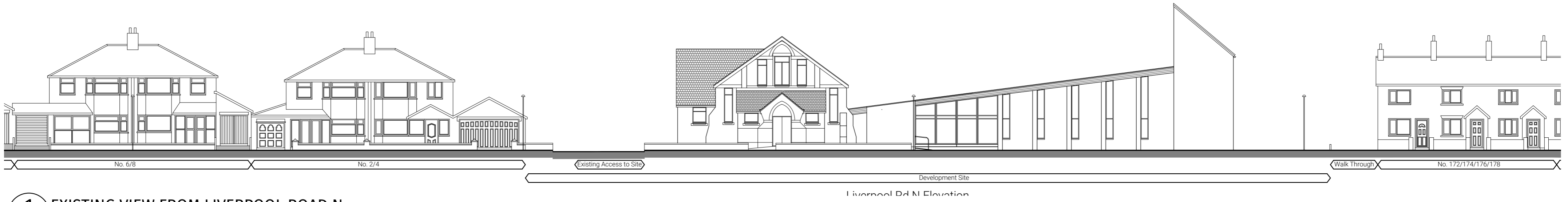
1 EXISTING VIEW FROM LIVERPOOL ROAD N 1:200