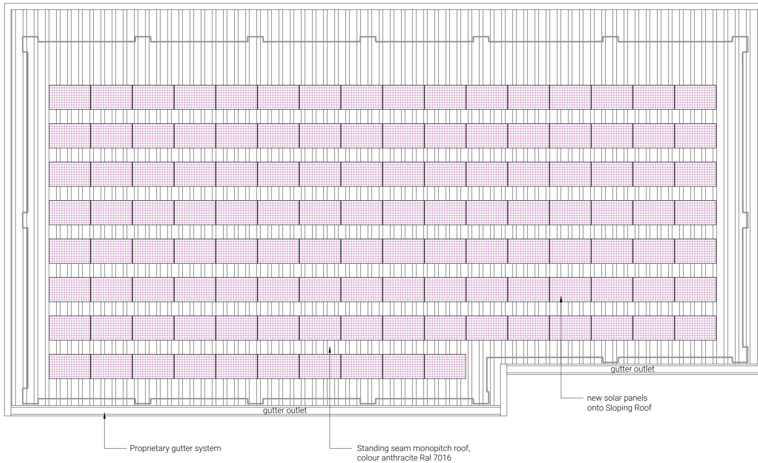
1 PROPOSED ROOF PLAN 1:100