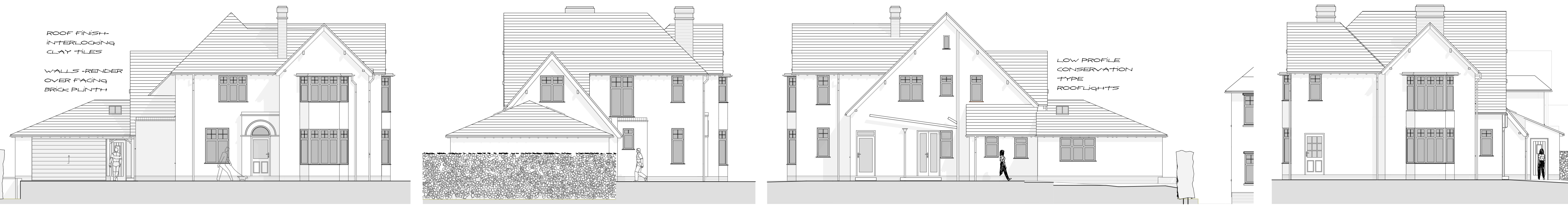
South Elevation 1:100 West Elevation 1:100 North Elevation 1:100 East Elevation 1:100

LOW PROFILE CONSERVATION TYPE ROOFLIGHTS