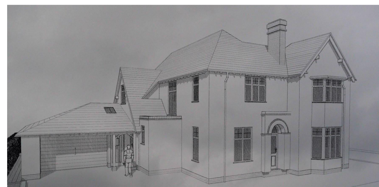
223.20.- Picture 9