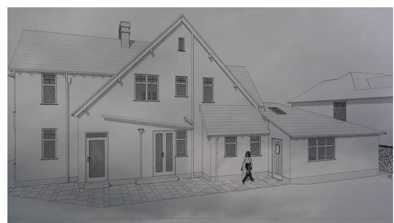
223.20.- Picture 8