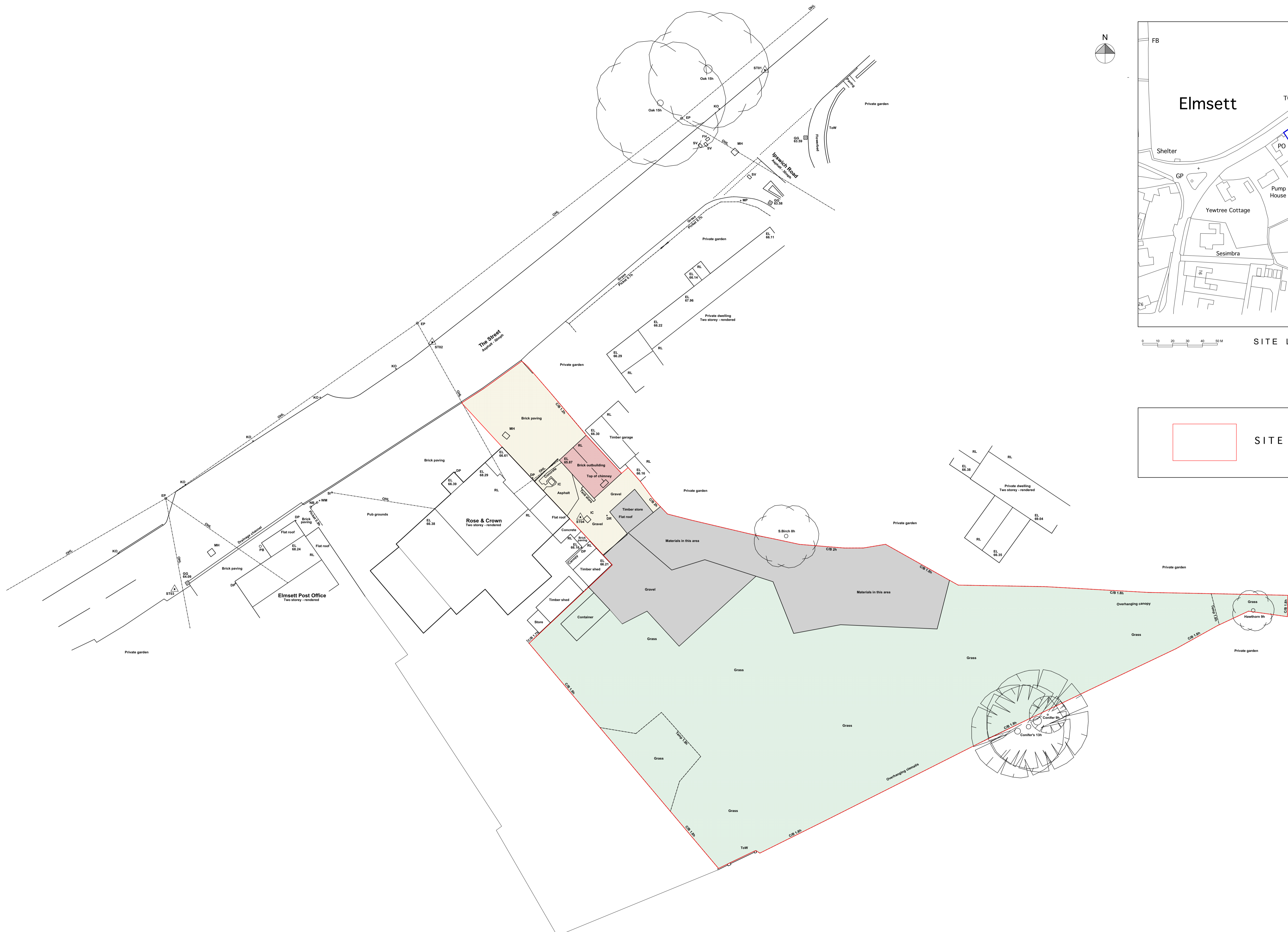
EXISTING SITE PLAN 1:200