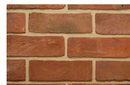
Soft red brick plinth with white cement mortar joints Imperial Bricks - Soft Red Multi