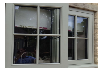
Painted timber joinery