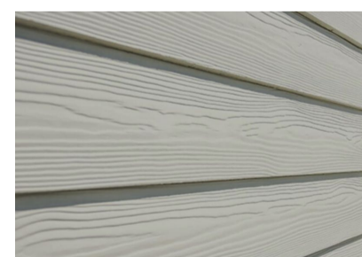
Grey/green coloured boarding