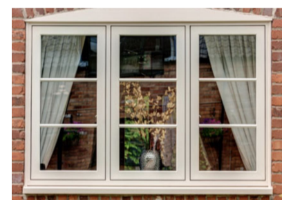
Painted timber joinery