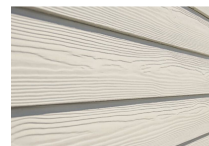
Cream coloured boarding