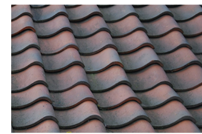
Lifestiles - Restoration pantile