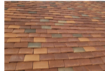
Lifestiles - Plain multi