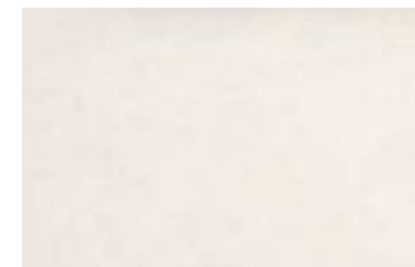
Cream coloured render