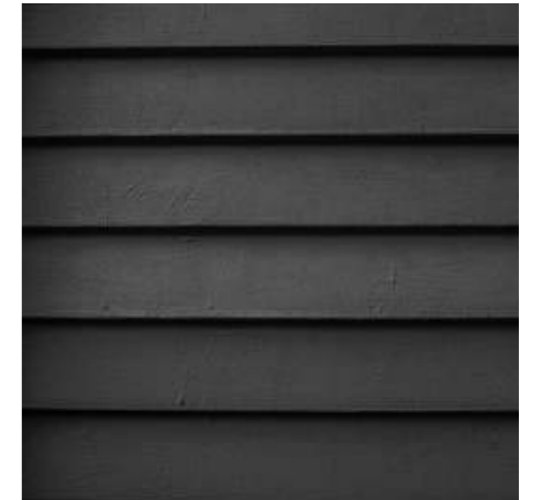
DARK STAINED WEATHERBOARDS