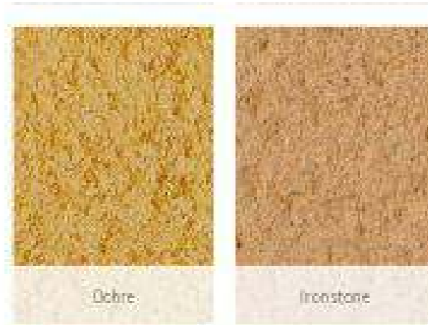
'SUFFOLK' OCHRE/IRONSTONE RENDER COLOUR