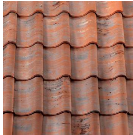
LOCALLY REFERENCED RED/GREY/BLACK MIX CLAY PANTILES TO THE OUTBUILDING