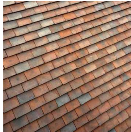
LOCALLY REFERENCED RED/GREY/BLACK MIX CLAY PLAIN TILES TO THE DWELLING