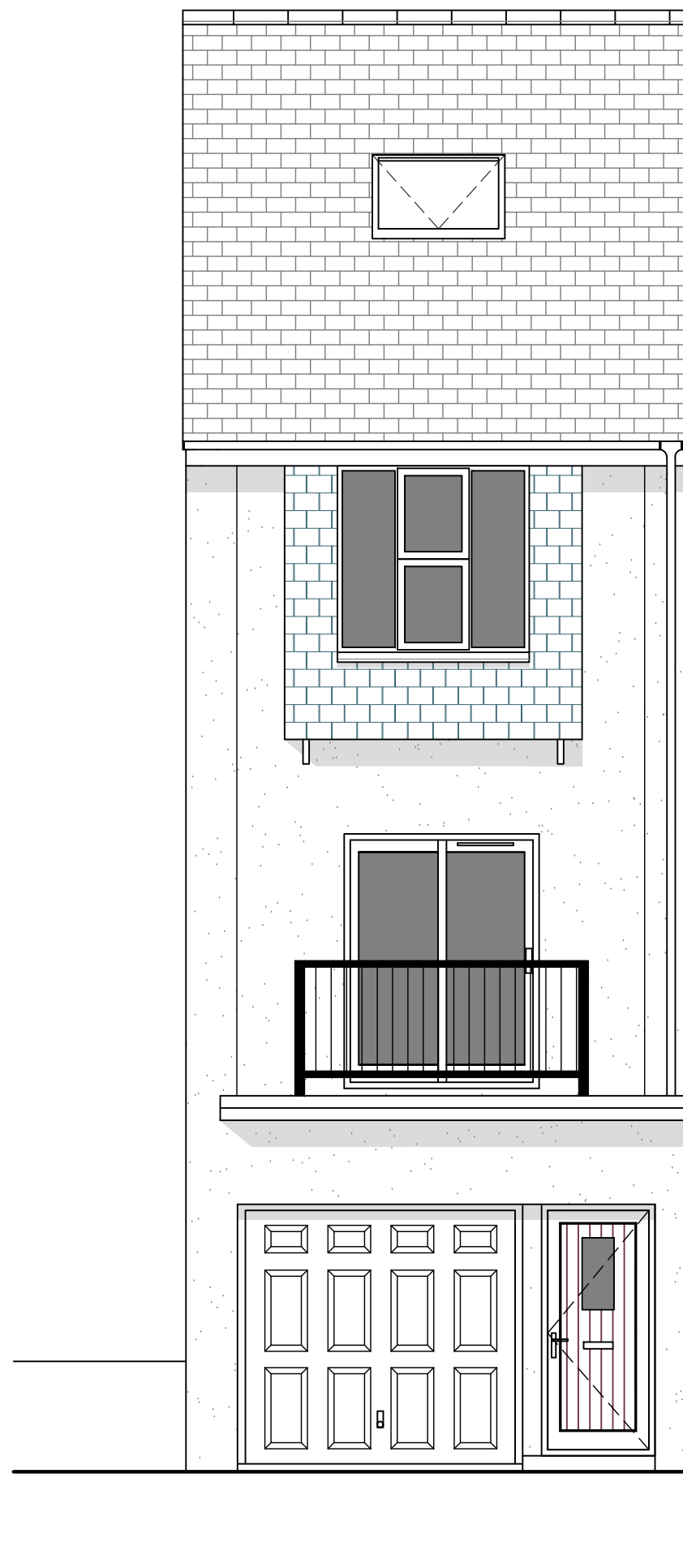
existing front elevation (NE) scale 1:50 @A3