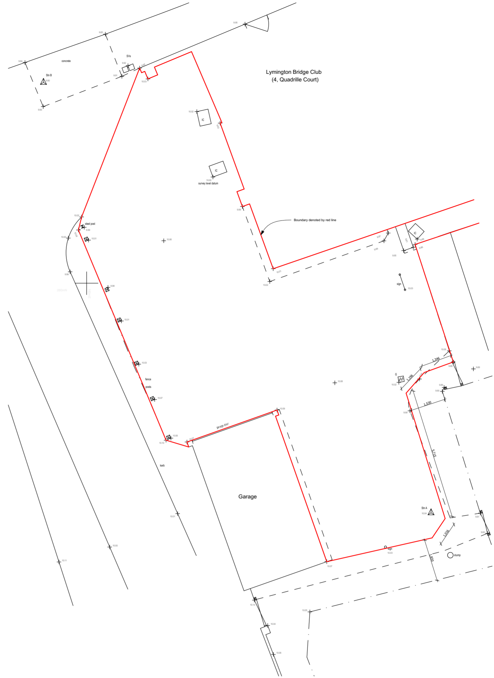
SITE PLAN (BOUNDARY)