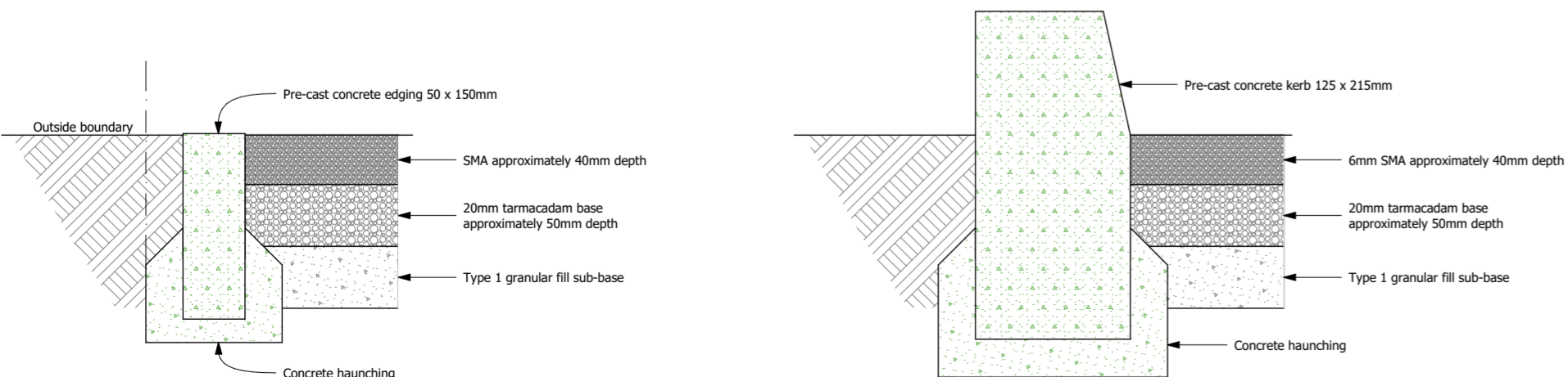
EDGE & KERB DETAIL