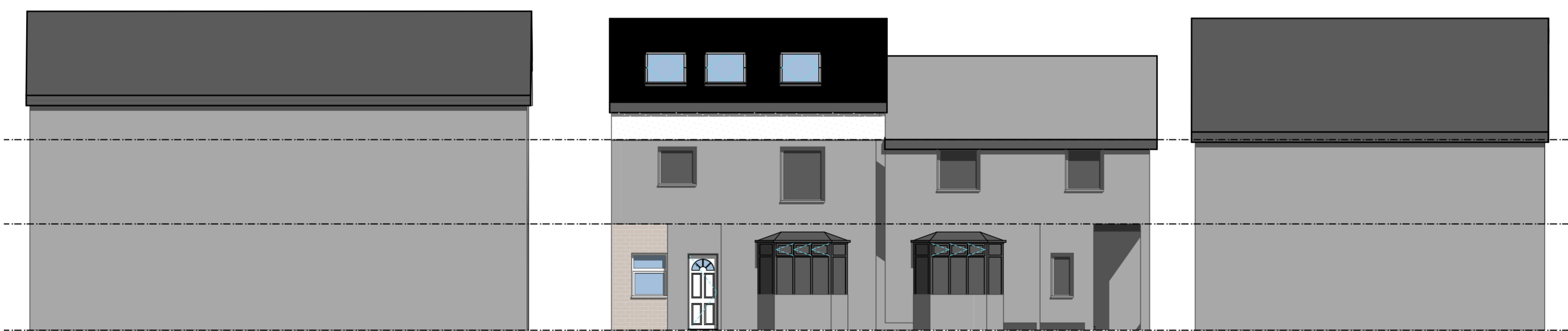
PROPOSED 4 EAST (3) 1:100