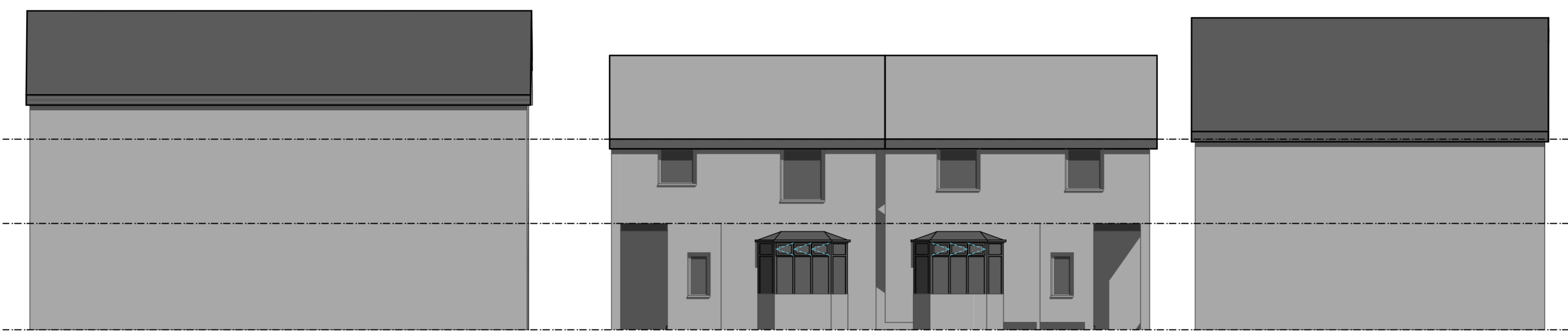
EXISTING 4 EAST (2) 1:100