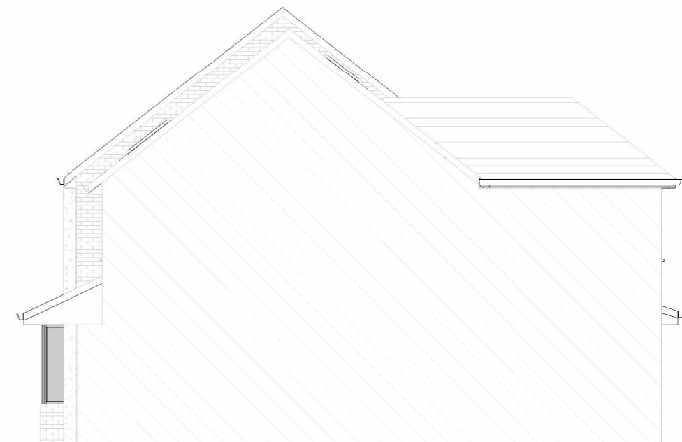
EXISTING SIDE B ELEVATION