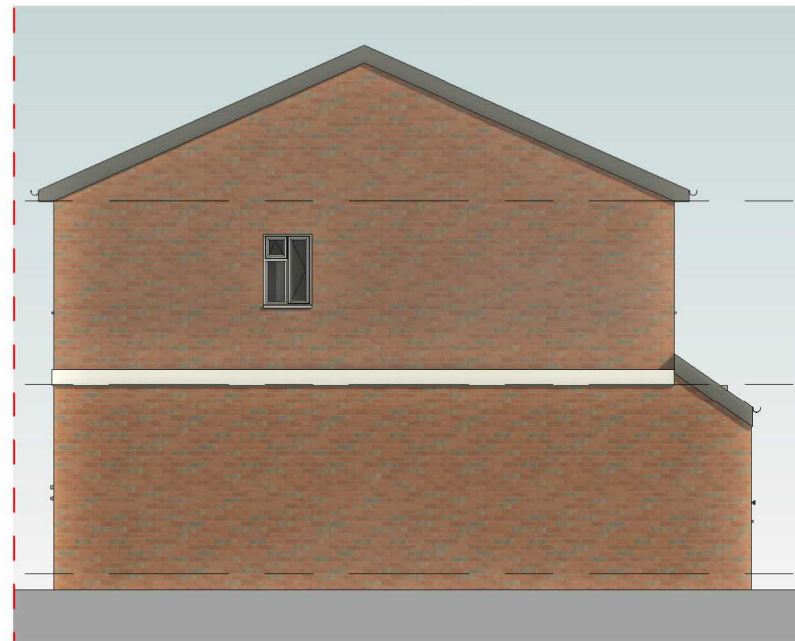
4 South/West 1 : 100