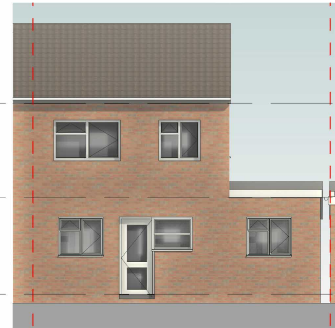
2 North/West 1 : 100