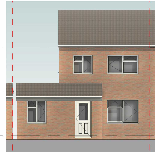
3 South/East 1 : 100