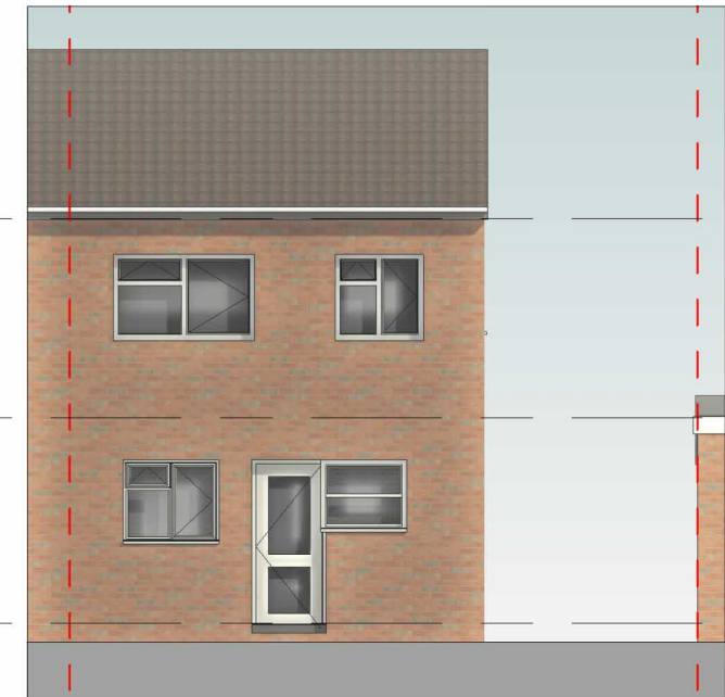
2 North/West 1 : 100