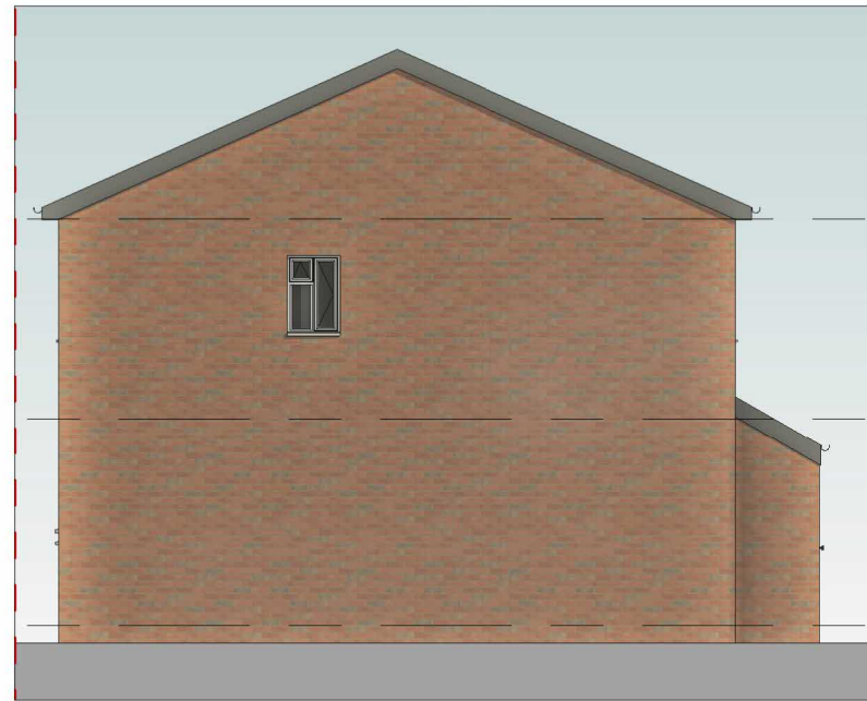
4 South/West 1 : 100