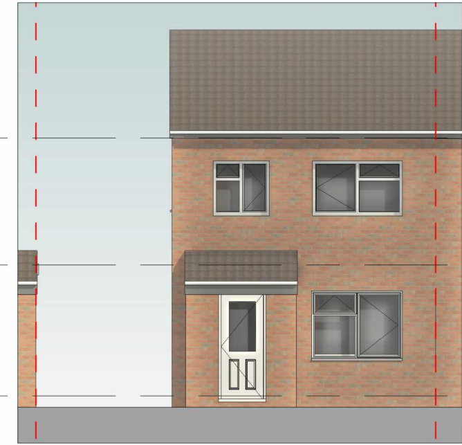
3 South/East 1 : 100