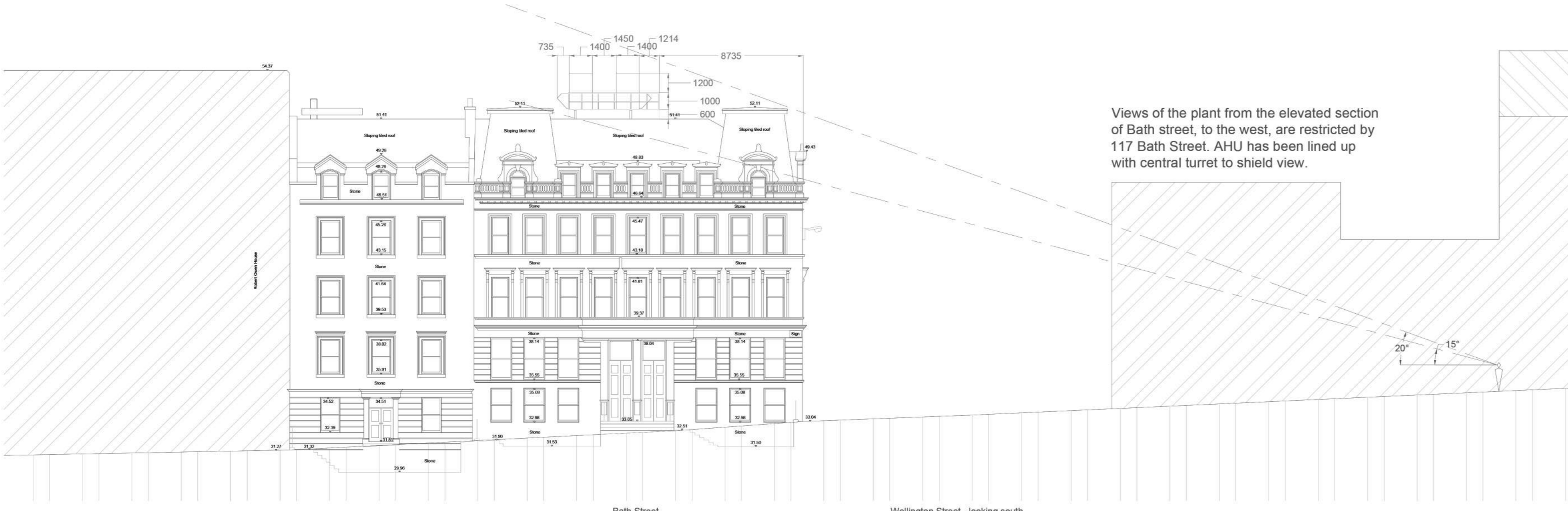
3 Bath Street - Proposed Elevation 1:200