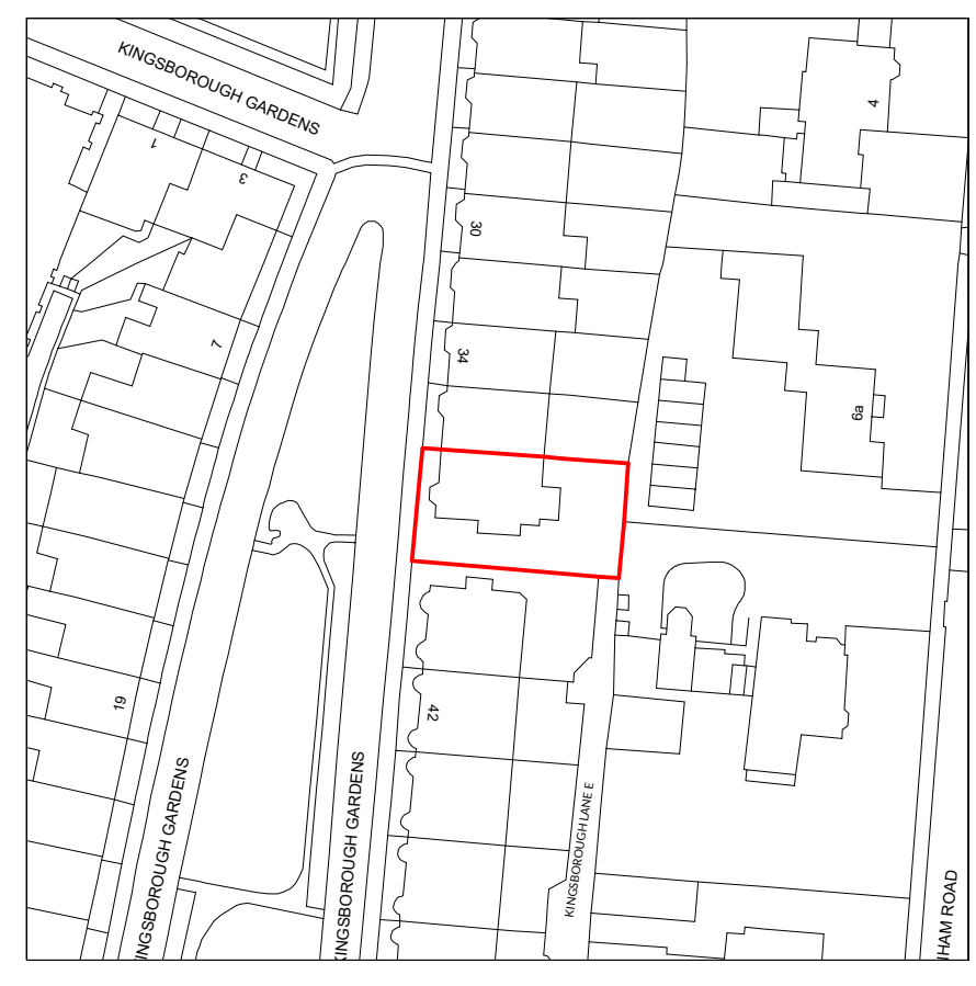
1 LOCATION PLAN - AS EXISTING 1:1250 Scale (metres)