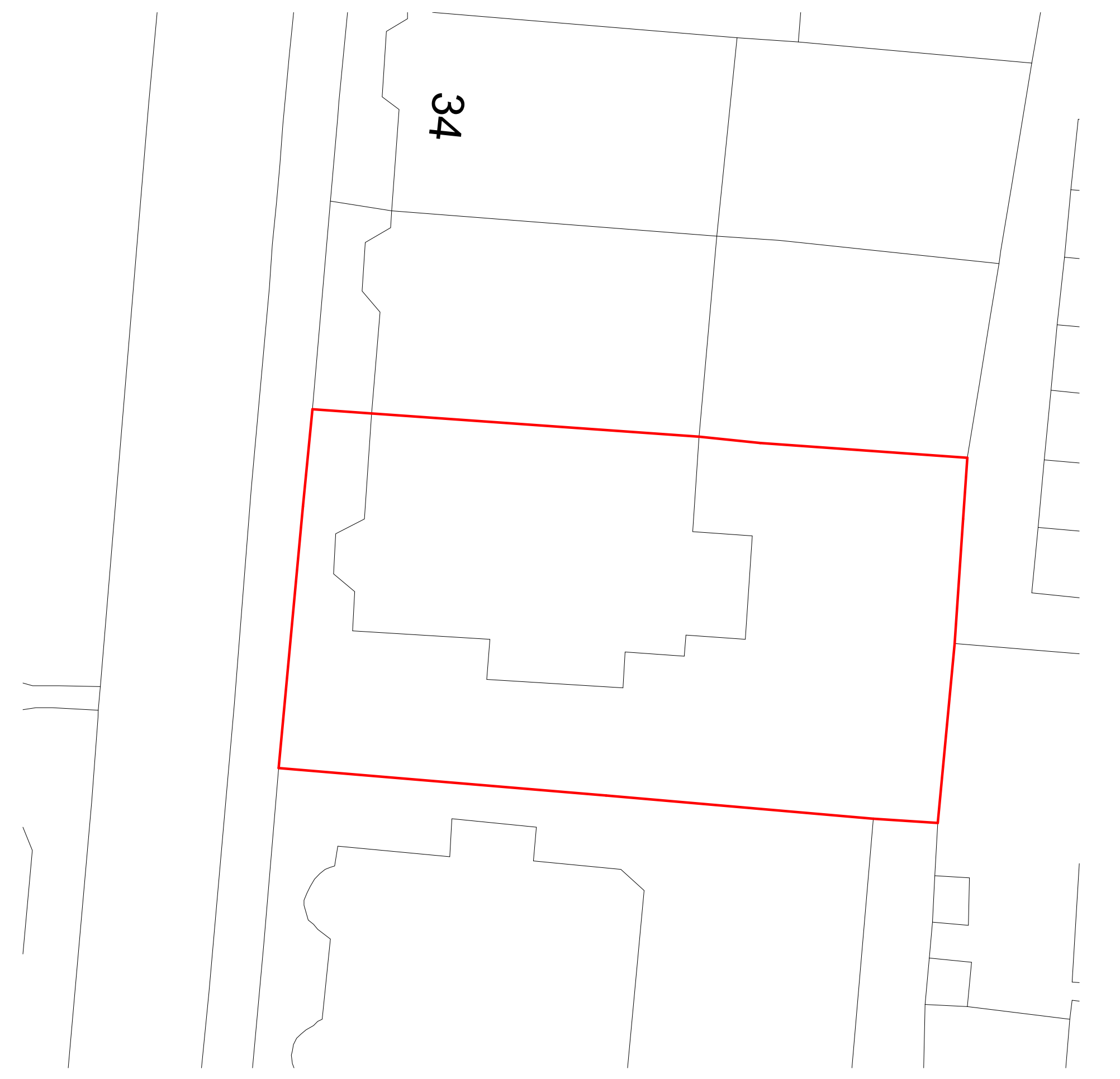
3 SITE PLAN - AS EXISTING 1:200 Scale (metres)