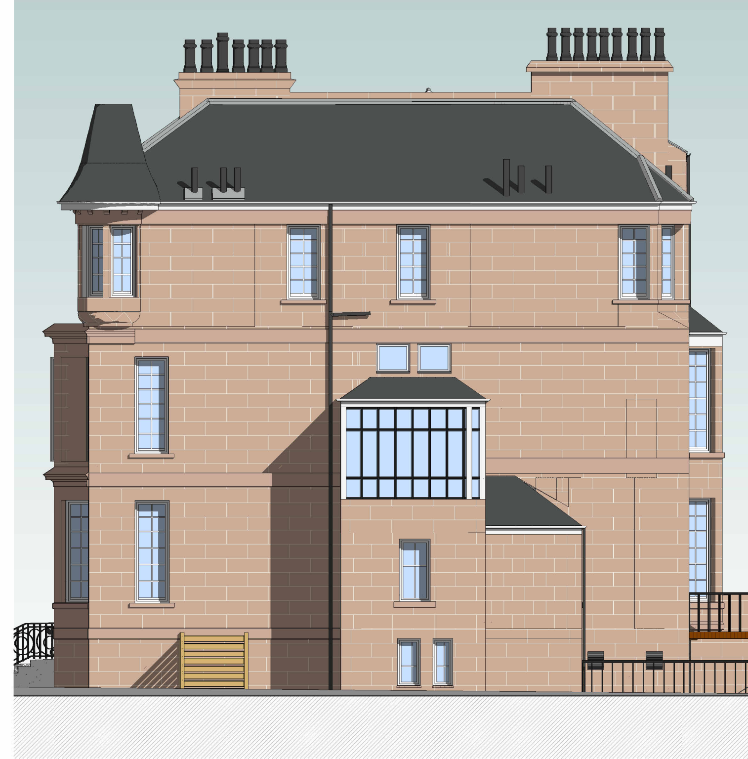
B ELEVATION B 1:100