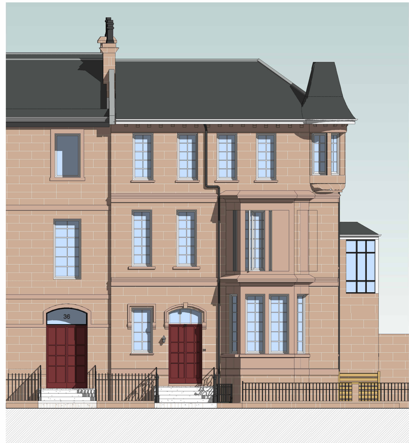
C ELEVATION C 1:100