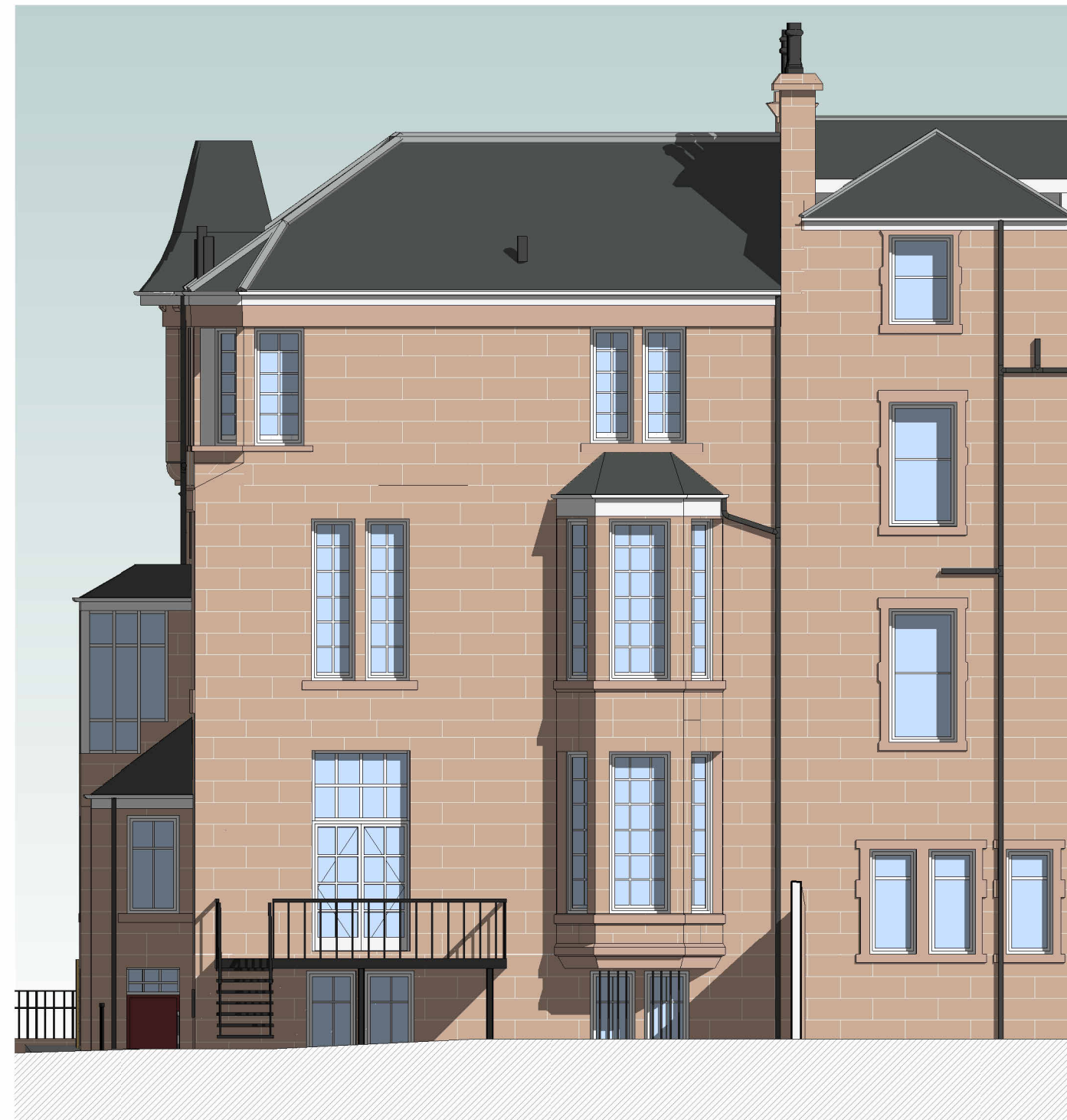
A ELEVATION A - AS EXISTING 1:100