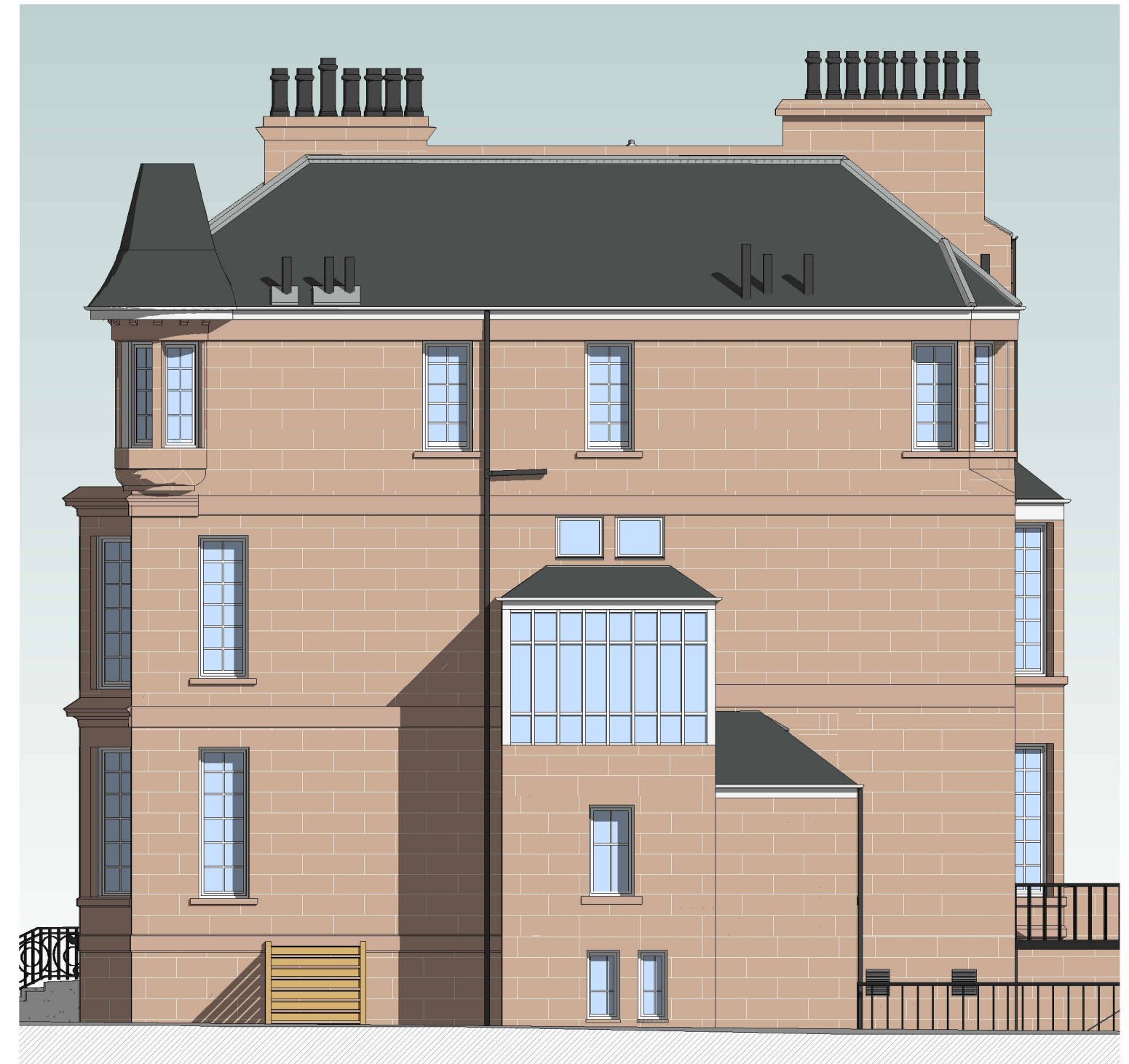
B ELEVATION B - AS EXISTING 1:100