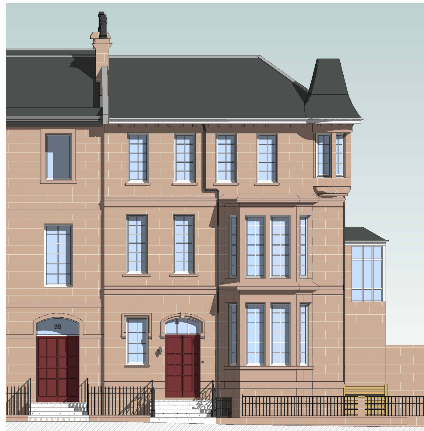
C ELEVATION C - AS EXISTING 1:100