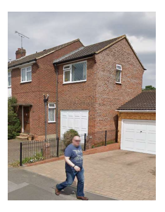
16 York Way