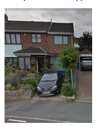
19 York Way