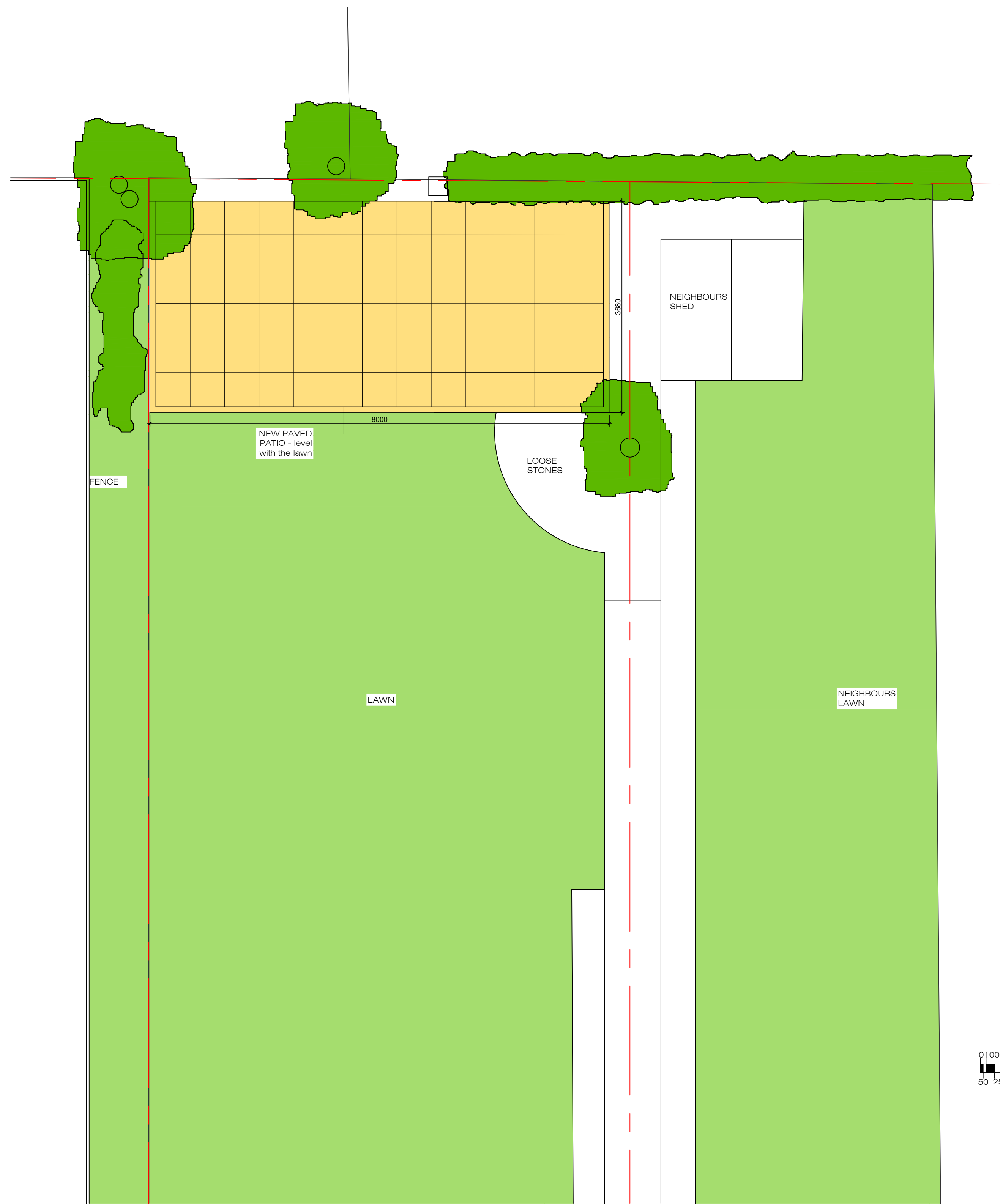
PROPOSED GARDEN PLAN 1:50