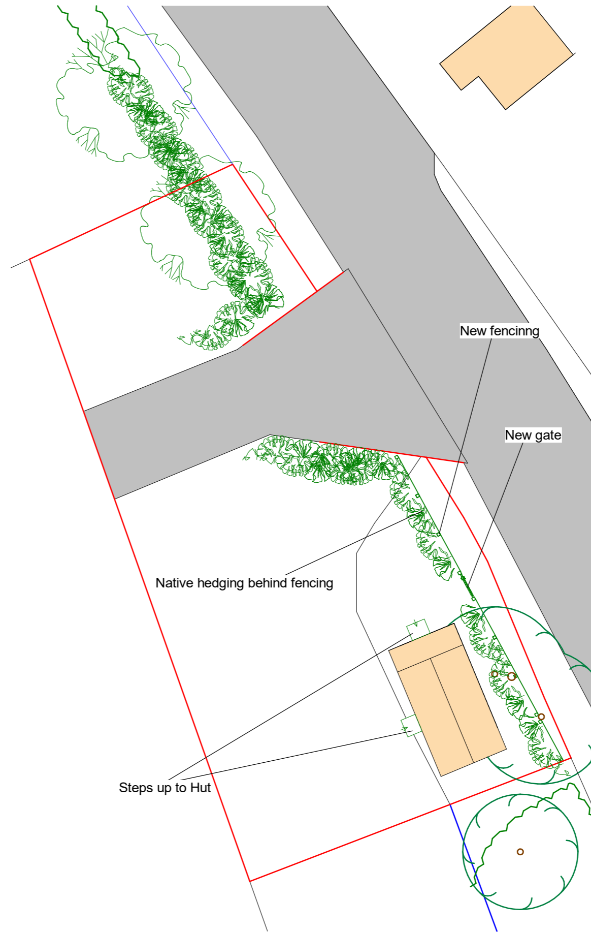
Block Plan - Proposed Hut 1 : 200