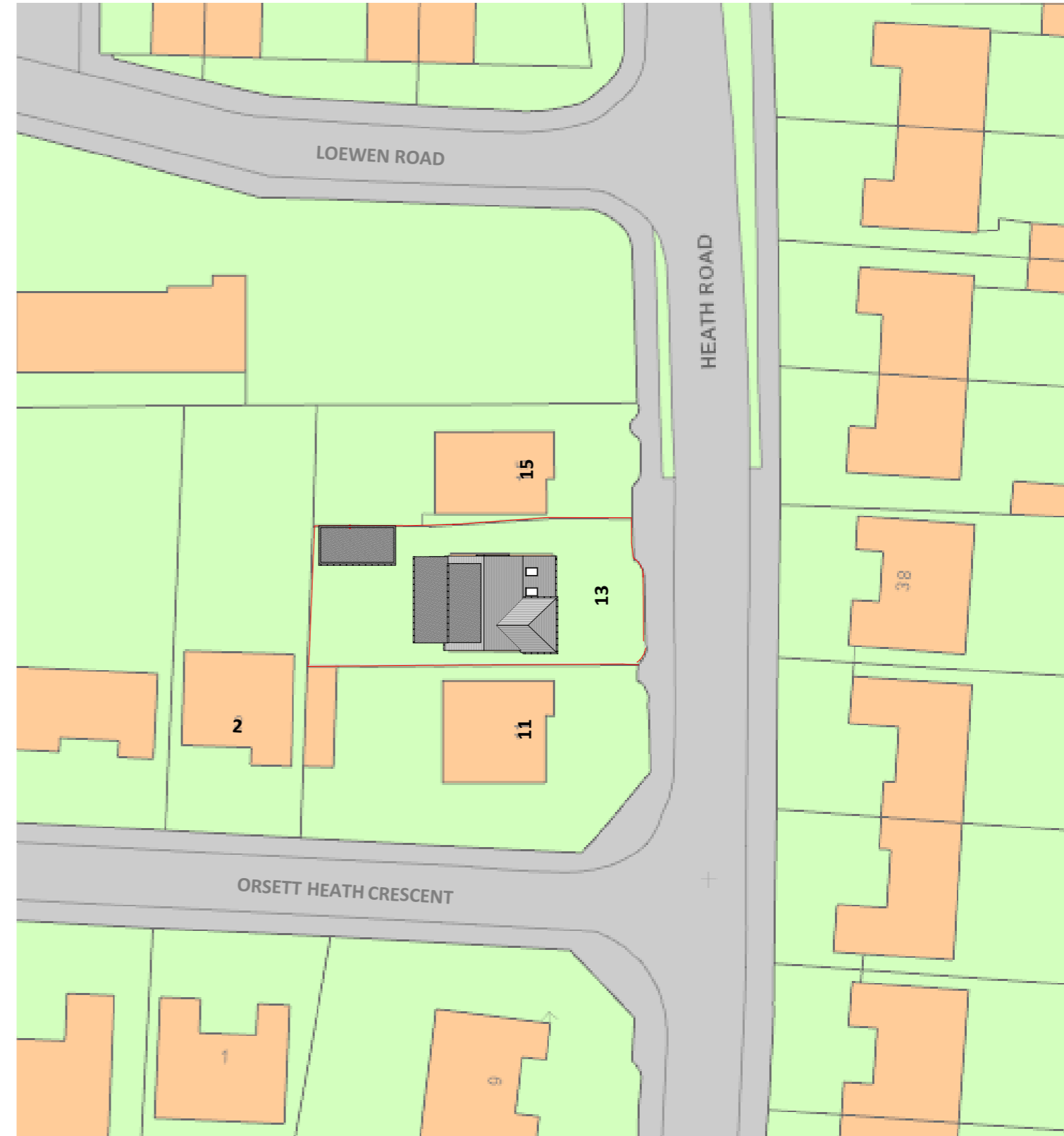
BLOCK PLAN scale 1:500

COPYRIGHT: The contents of this drawing may not be reproduced in whole or in part without express written consent of ARKSS Design Studio Limited.