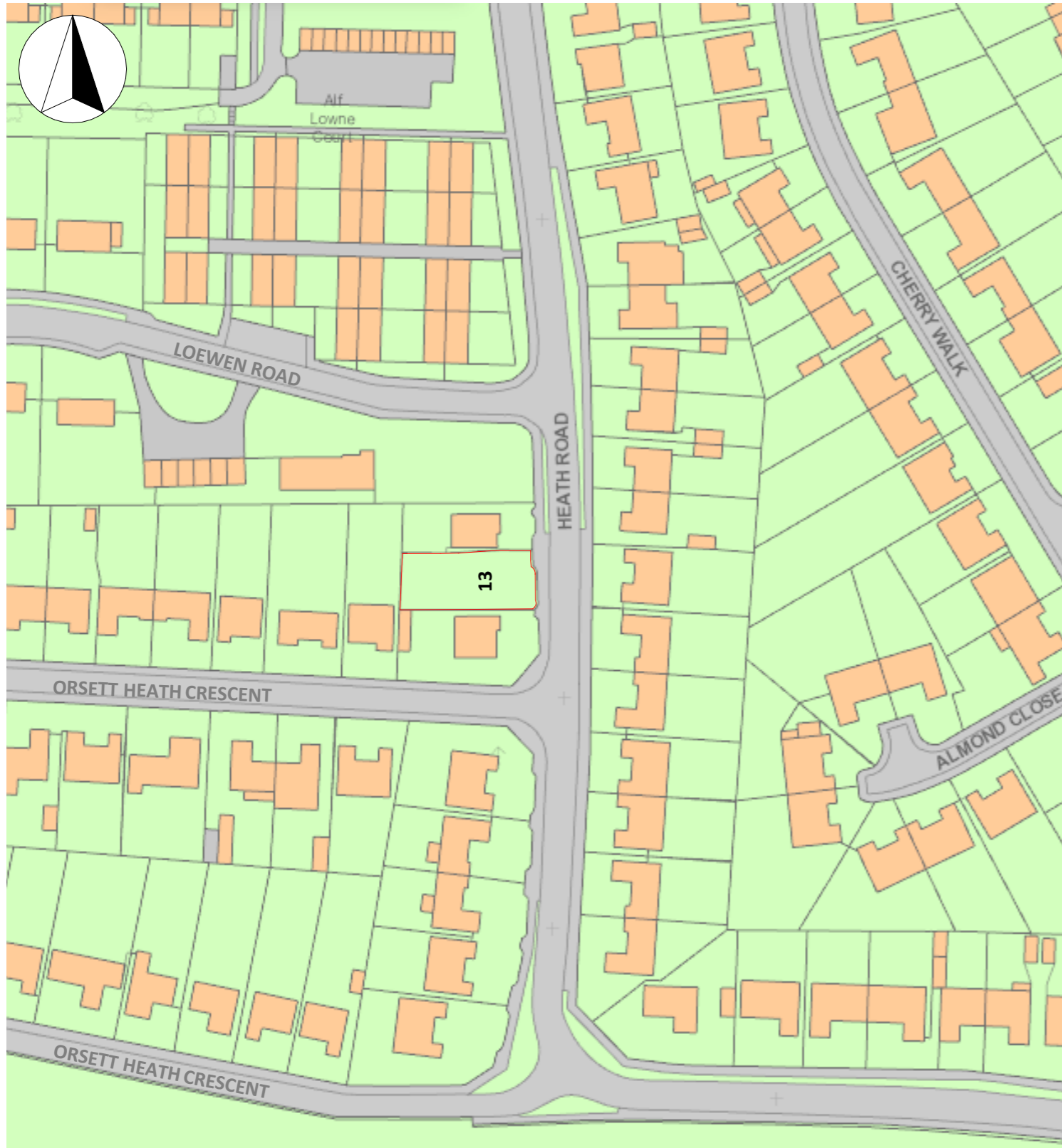
LOCATION MAP scale 1:1250