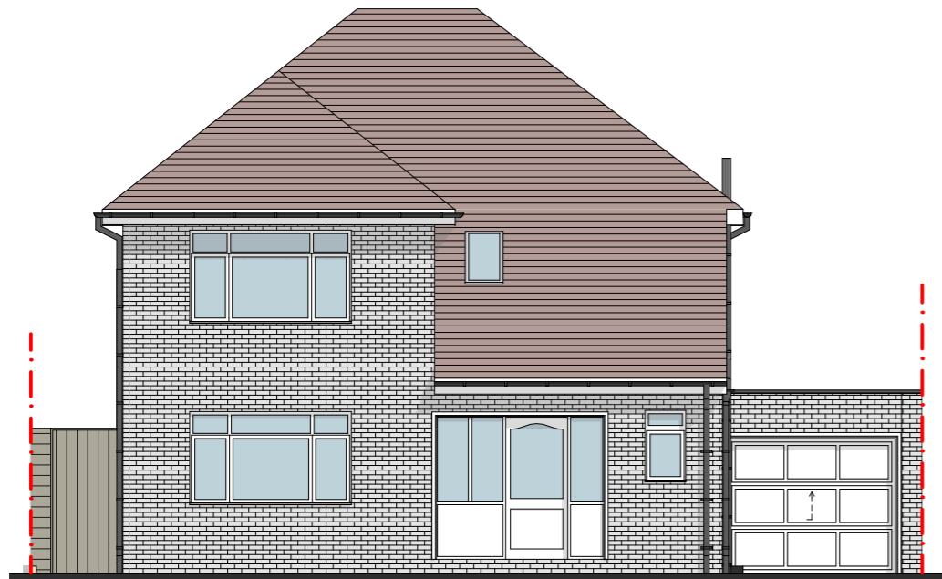
Pre-Existing Front Elevation 1:100