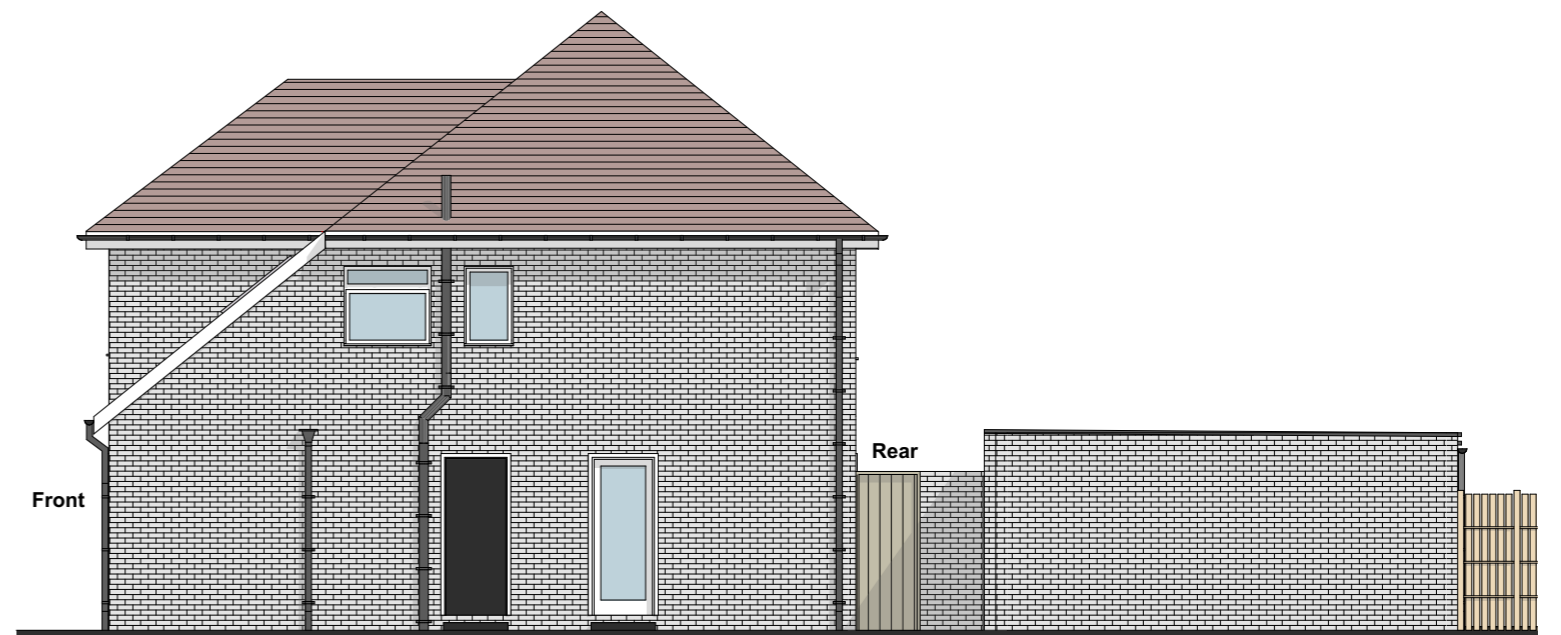
Pre-Existing Side Elevation 1:100

COPYRIGHT: The contents of this drawing may not be reproduced in whole or in part without express written consent of ARKSS Design Limited.