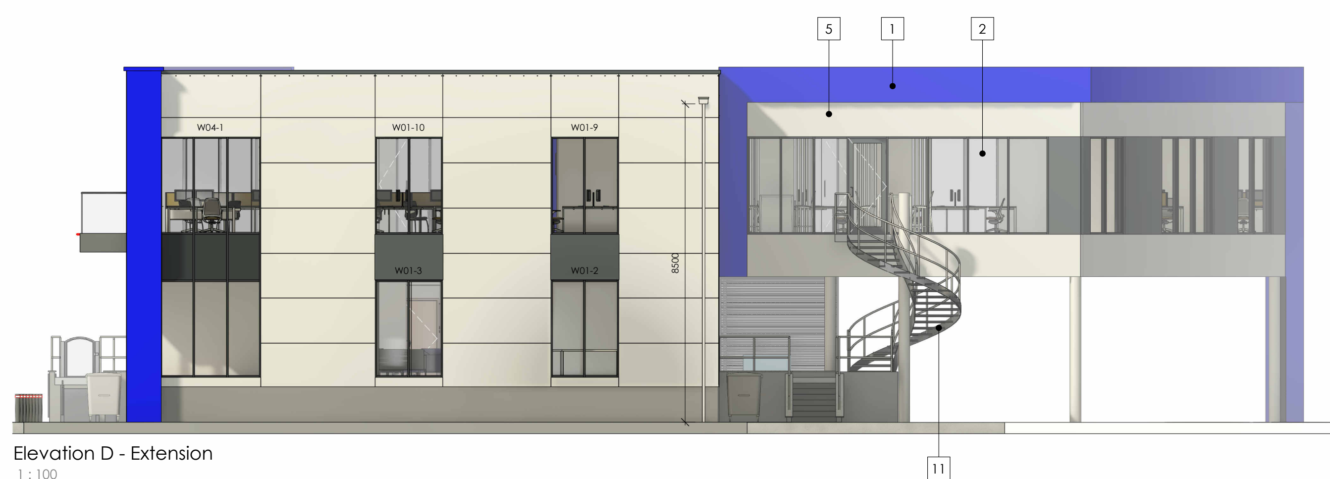
D Elevation D - Extension 1 : 100