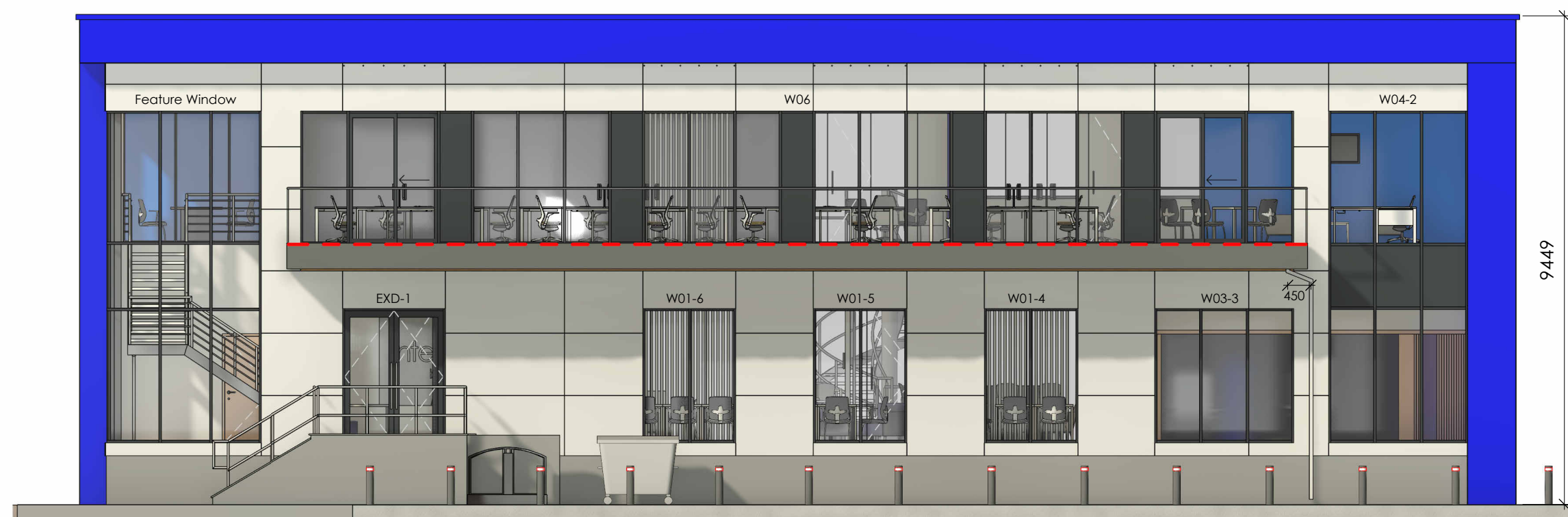
A Elevation A - Extension 1 : 100