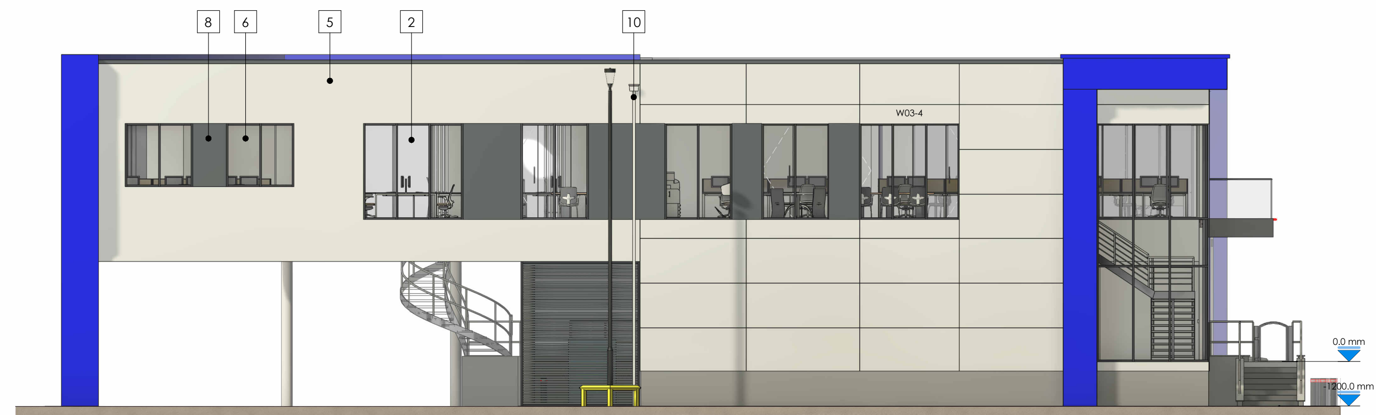
B Elevation B - Extension 1 : 100