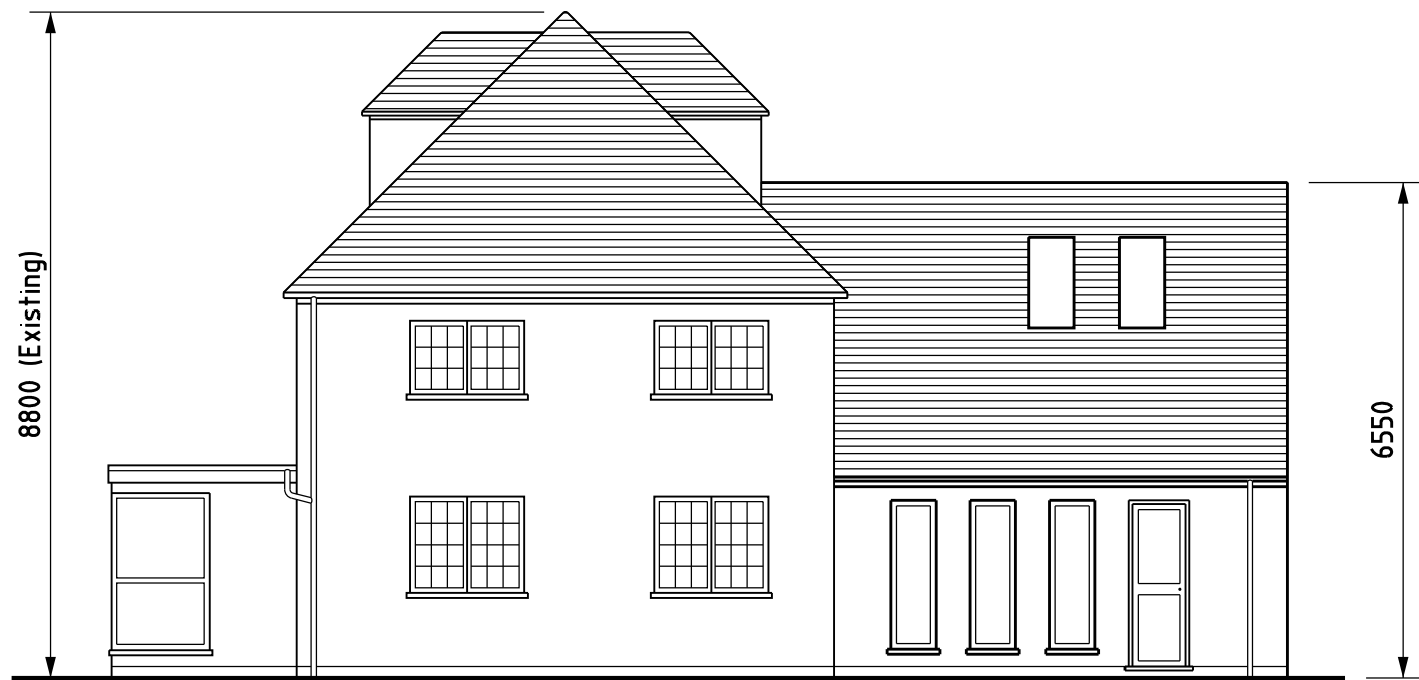
Side Elevation (Street facing)