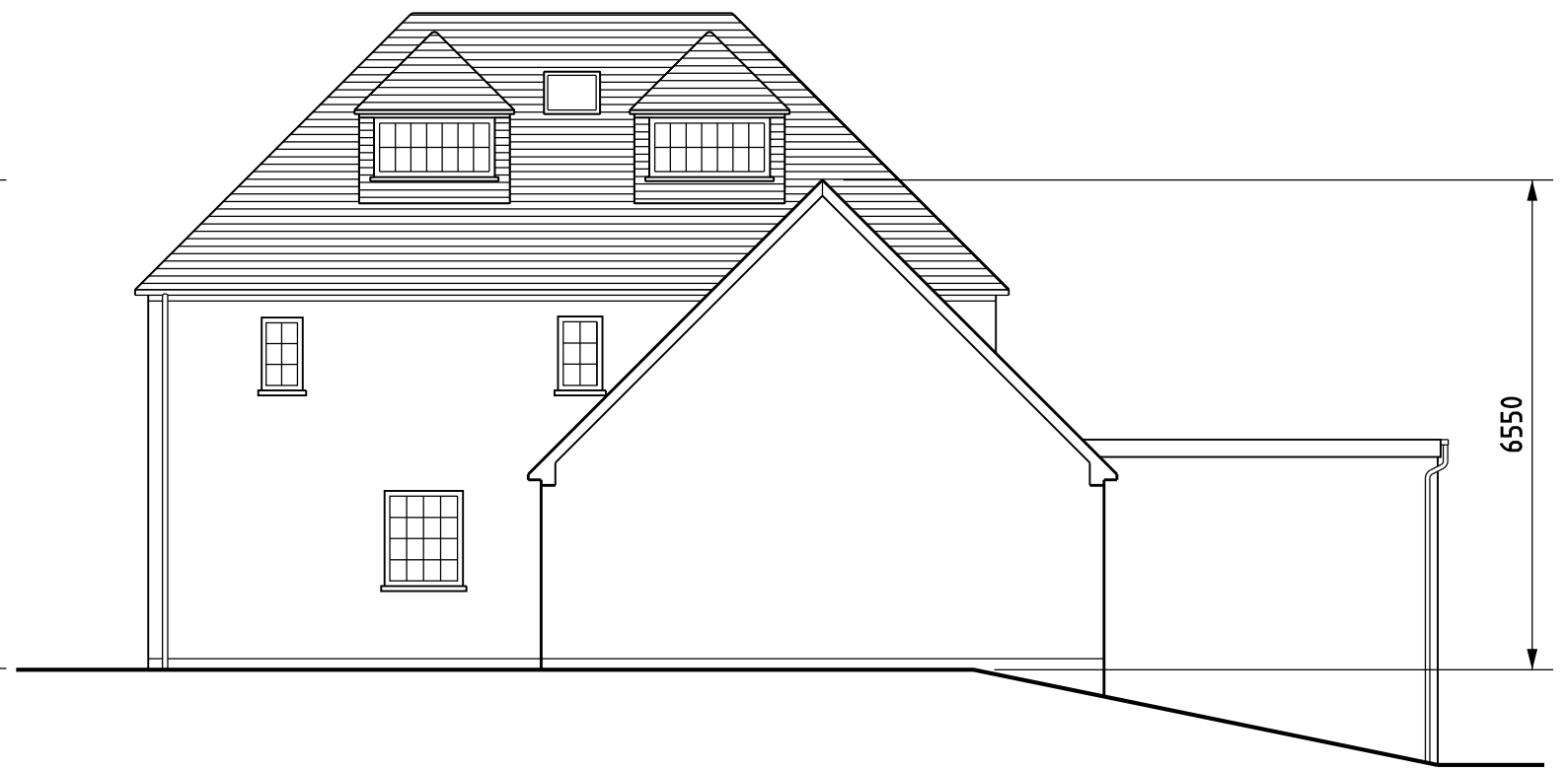
Front Elevation (North east)