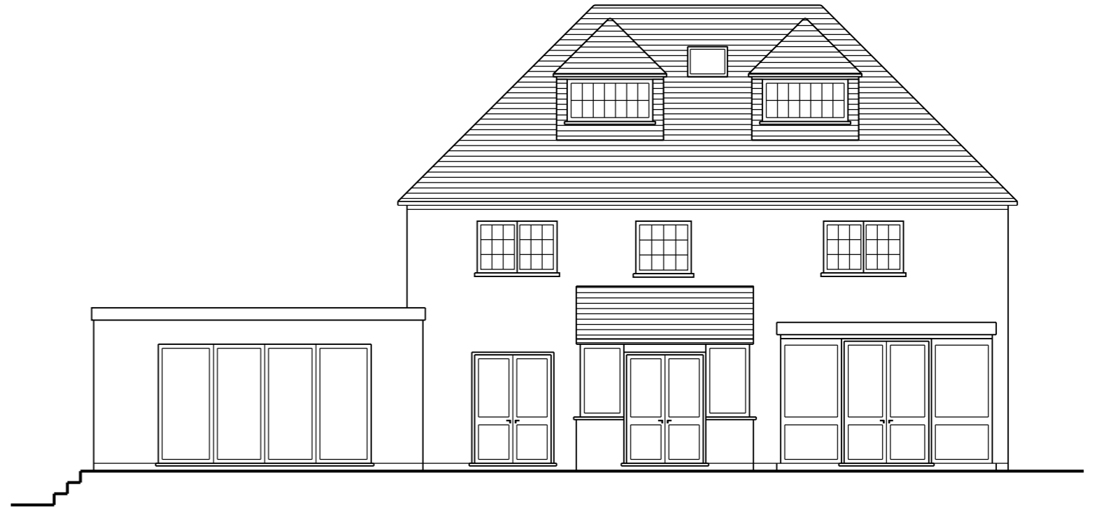
Rear Elevation (South west)