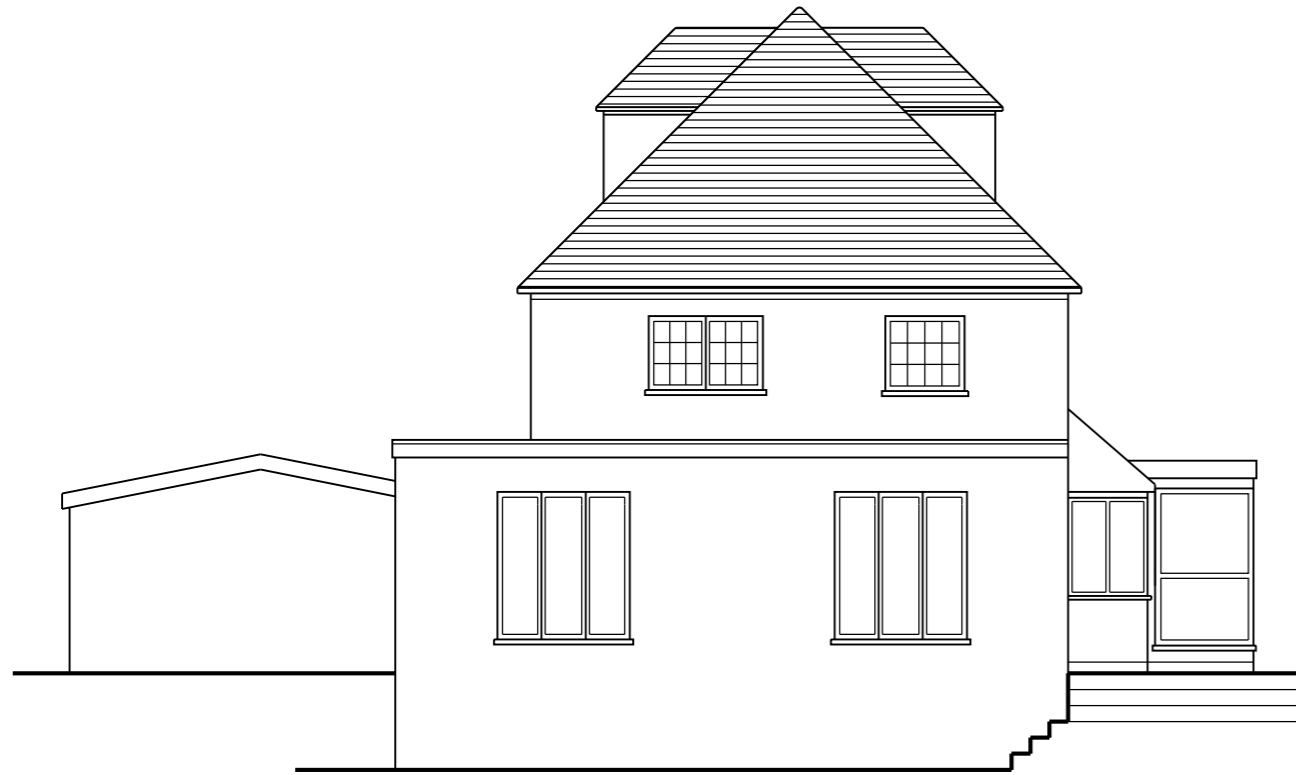
Side Elevation (North west)