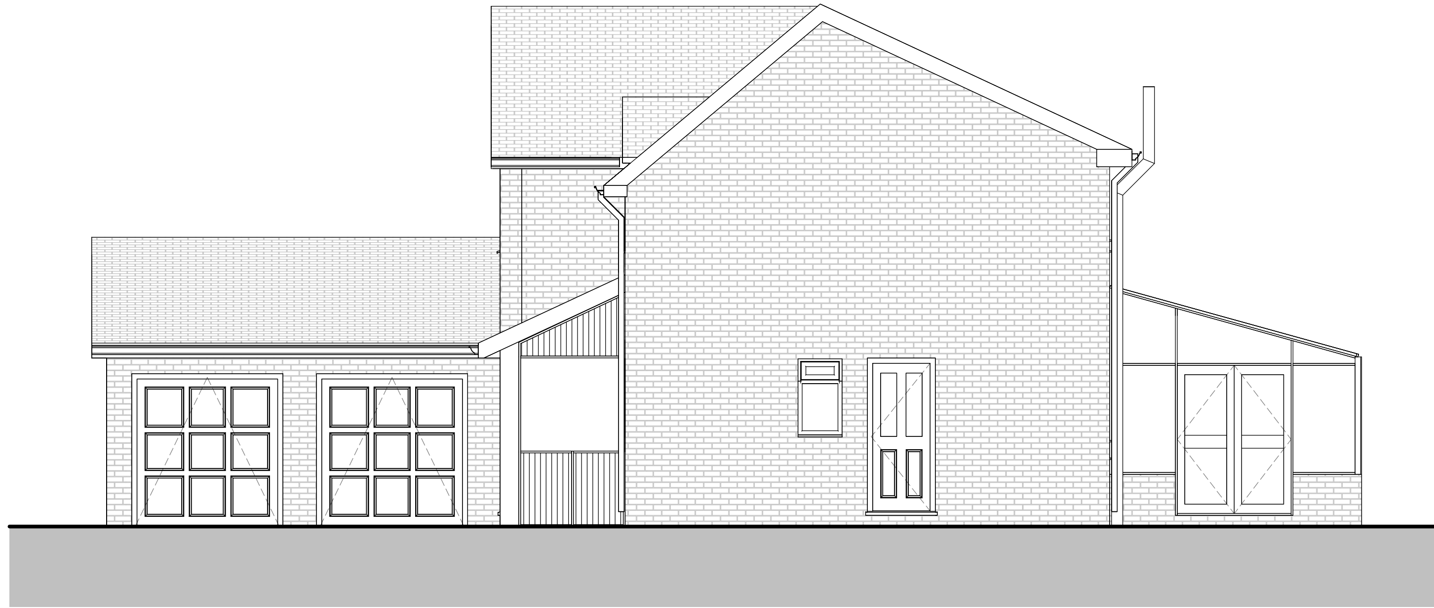
Existing gable elevation 02