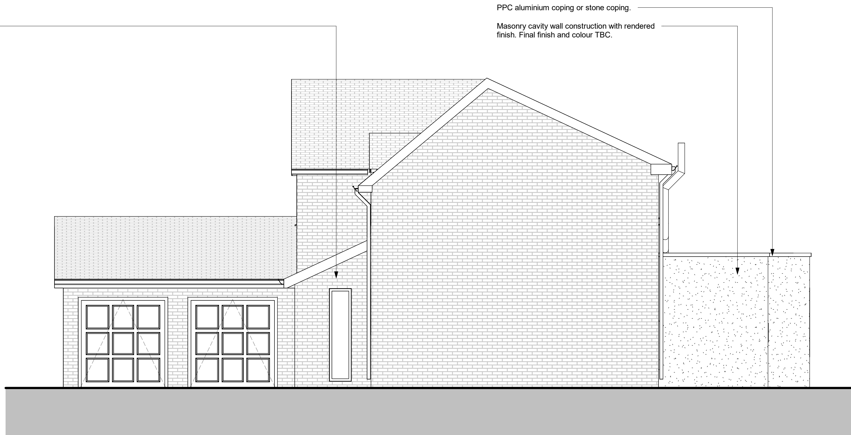
Proposed gable elevation 02