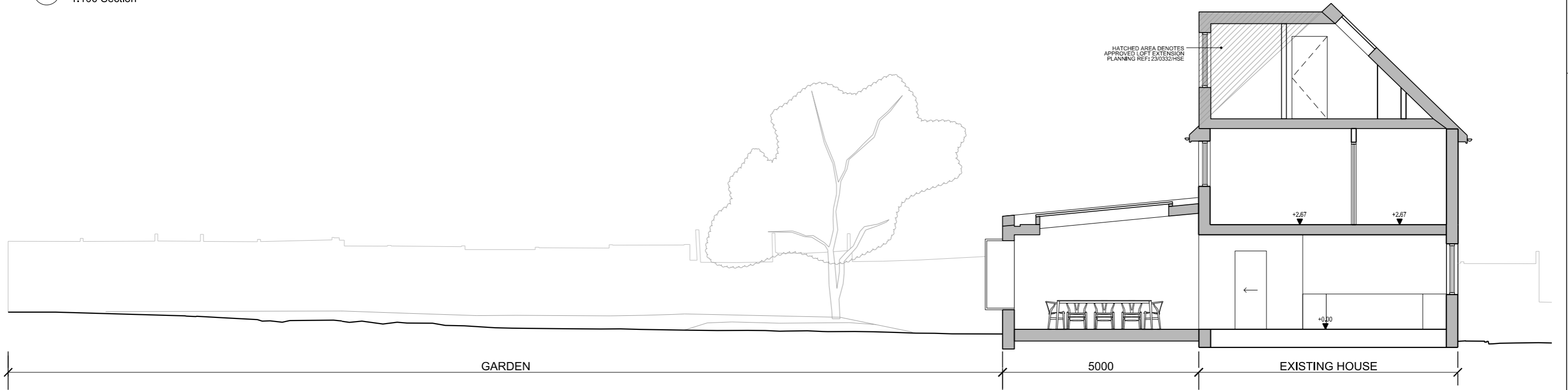
2 Proposed Section AA 1:100 Section