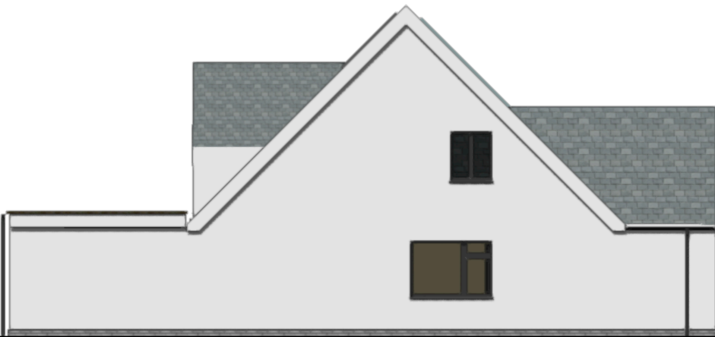
NORTH ELEVATION 1:50