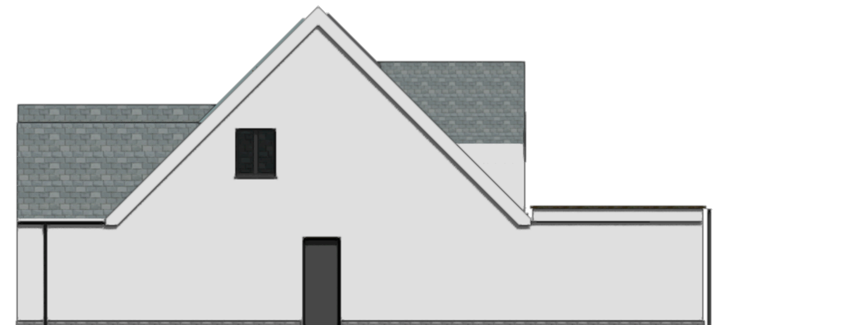
SOUTH ELEVATION 1:50