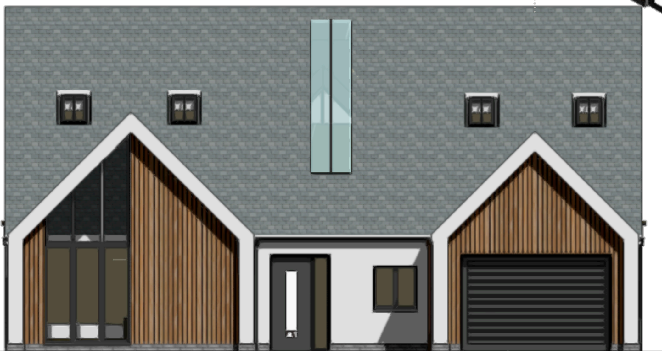
WEST ELEVATION 1:50