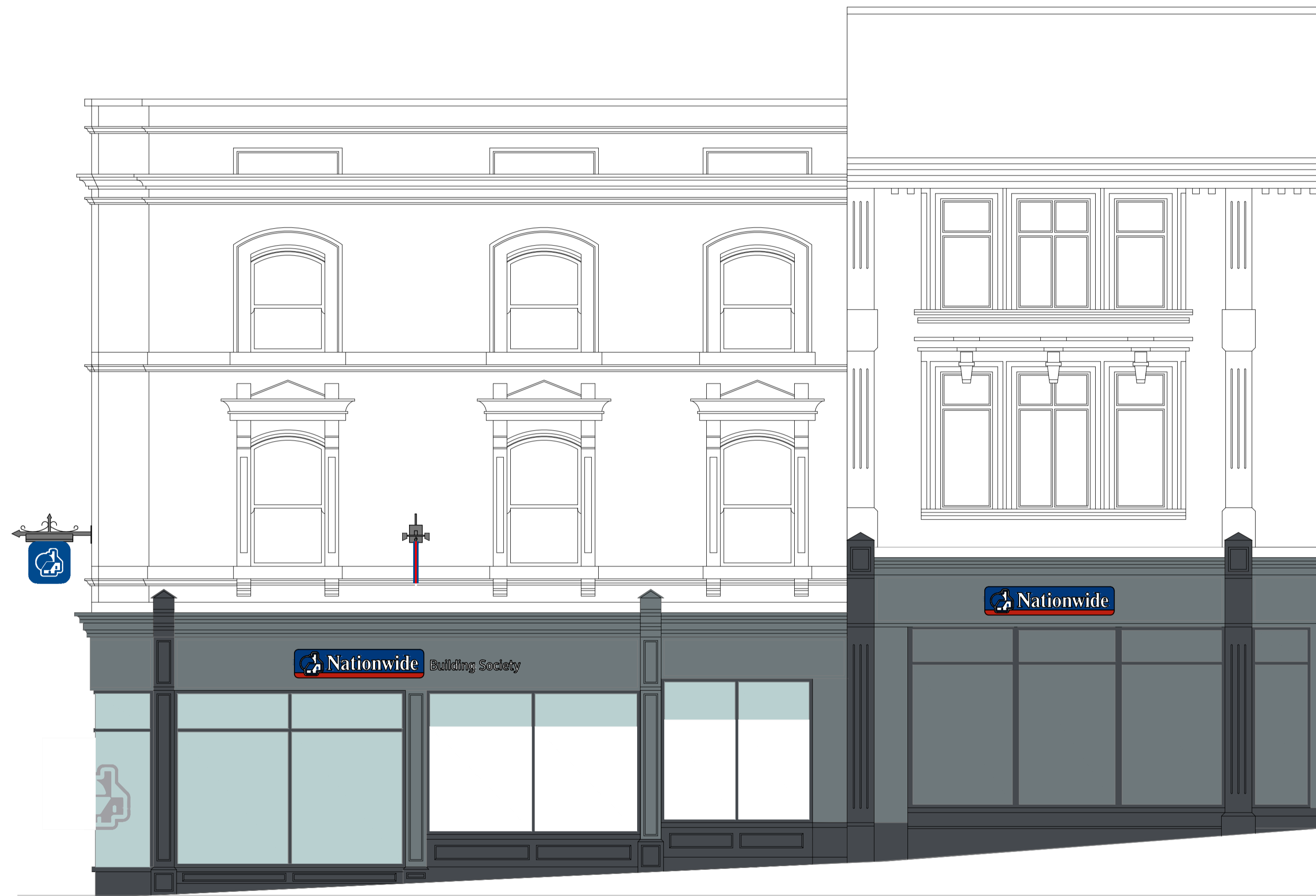
FRONT ELEVATION - WELLINGTON STREET

ALL DIMENSIONS MUST BE CHECKED ON SITE. ONLY FIGURED DIMENSIONS ARE TO BE WORKED FROM. DISCREPANCIES MUST BE REPORTED TO THE ARCHITECT BEFORE PROCEEDING.