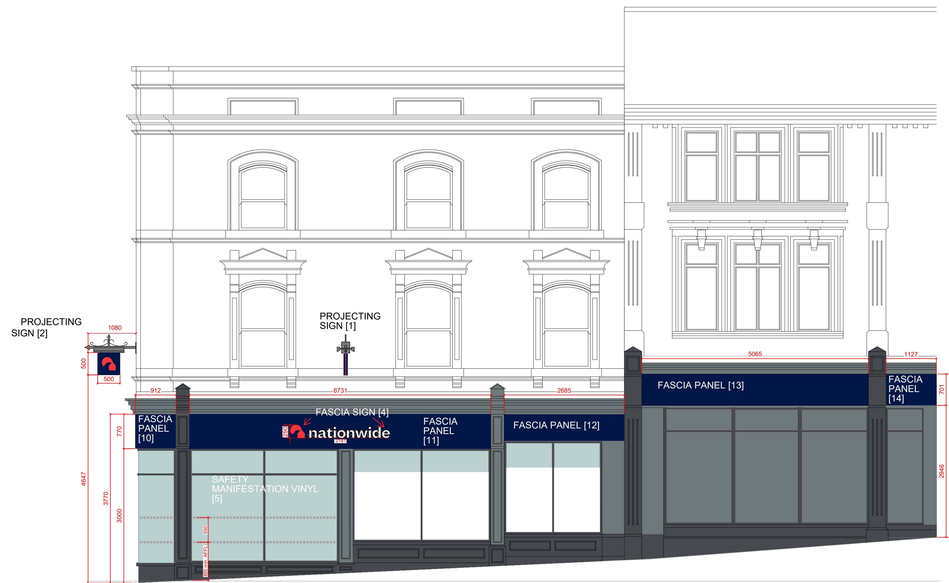
FRONT ELEVATION - WELLINGTON STREET

ALL DIMENSIONS MUST BE CHECKED ON SITE. ONLY FIGURED DIMENSIONS ARE TO BE WORKED FROM. DISCREPANCIES MUST BE REPORTED TO THE ARCHITECT BEFORE PROCEEDING.