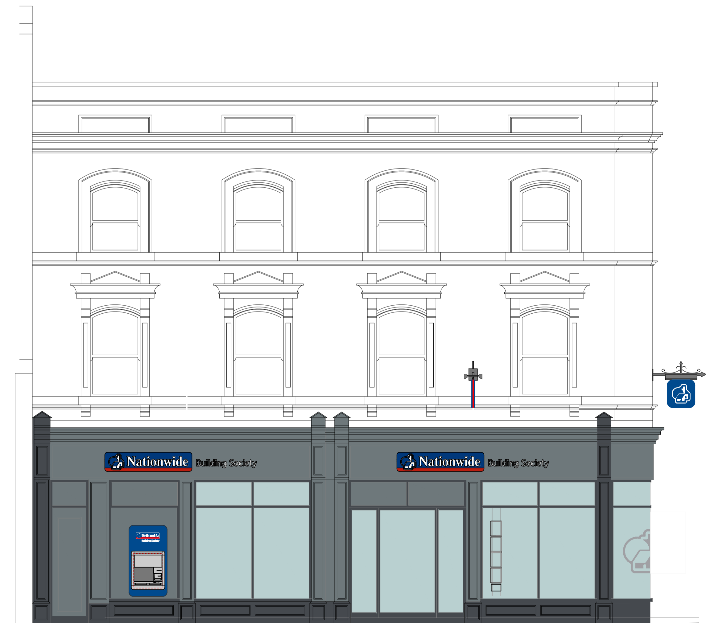
FRONT ELEVATION - GEORGE STREET

ALL DIMENSIONS MUST BE CHECKED ON SITE. ONLY FIGURED DIMENSIONS ARE TO BE WORKED FROM. DISCREPANCIES MUST BE REPORTED TO THE ARCHITECT BEFORE PROCEEDING.