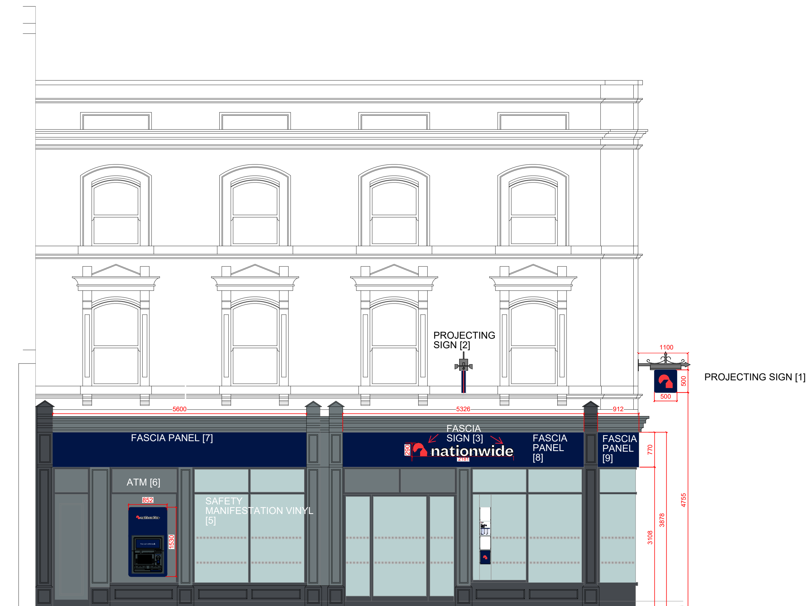
FRONT ELEVATION - GEORGE STREET

ALL DIMENSIONS MUST BE CHECKED ON SITE. ONLY FIGURED DIMENSIONS ARE TO BE WORKED FROM. DISCREPANCIES MUST BE REPORTED TO THE ARCHITECT BEFORE PROCEEDING.