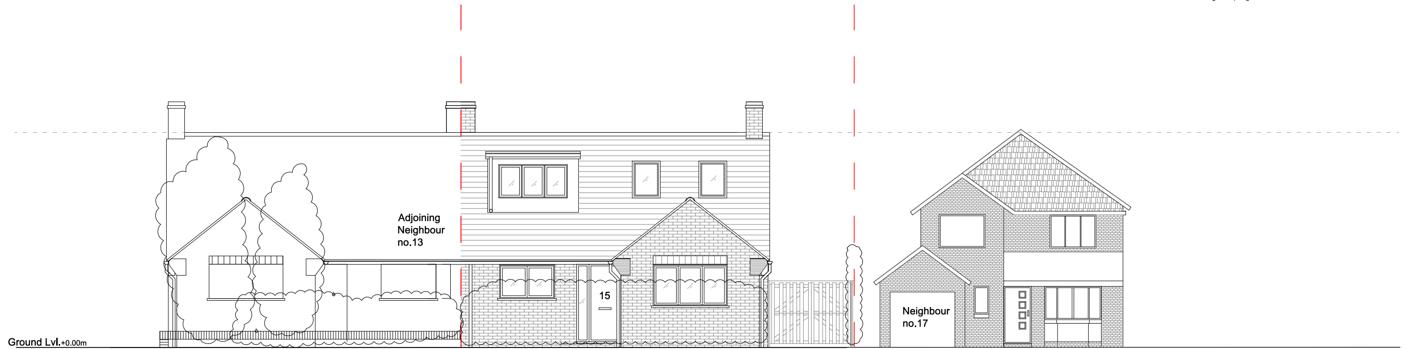
Existing Street Scene

GENERAL NOTES This scheme is subject to Town Planning and all other necessary consents. Dimensions, areas and levels where given are only approximate and subject to site survey. All dimensions are to be checked on site. All feasibility studies are subject to full site survey. This drawing is to be read in conjunction with all relevant consultants and/or specialists drawings/ documents and any discrepancies or variations are to be notified to the architects in writing before the affected work commences. All queries relating to design of structural elements are to be referred to the structural engineering consultant for resolution. The workmanship and materials of all trades and building operations shall comply with the recommendations of British Standard (BS)8000 parts 1-16 inclusive and with Approved Document to support Regulation 7 1999 edition (incorporating 2000 amendments) of the Building Regulations 2010. All design and construction is to be in accordance with the Construction (Design and Management) Regulations 2015.