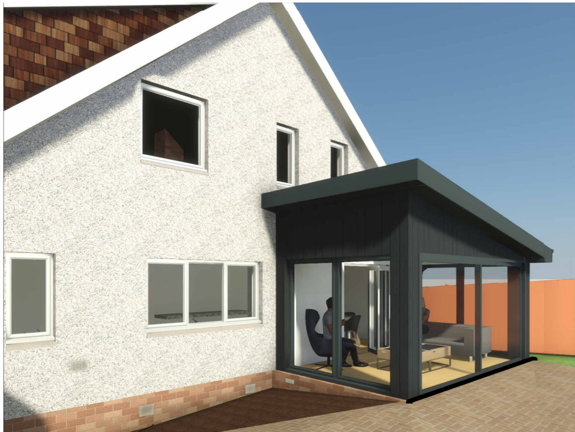
3D View 3