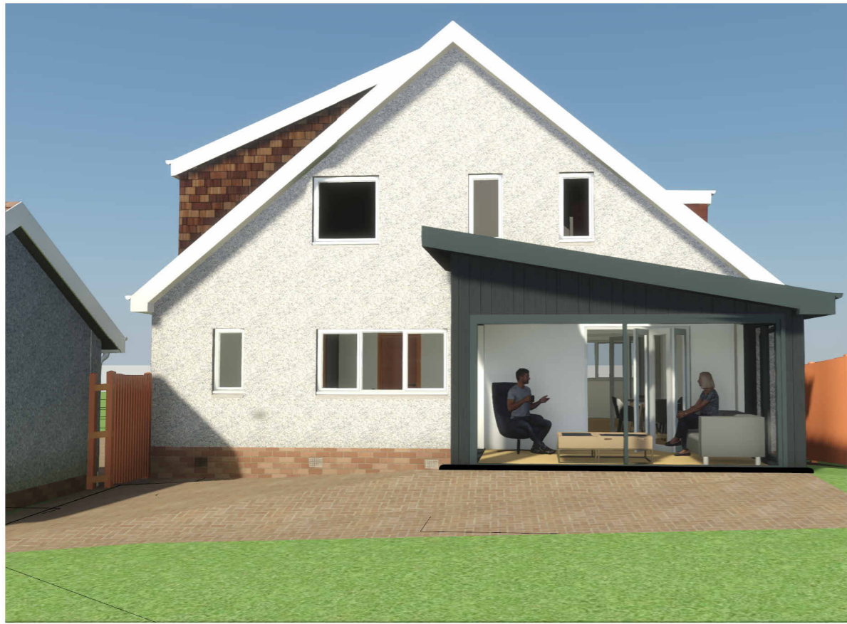
3D View 2