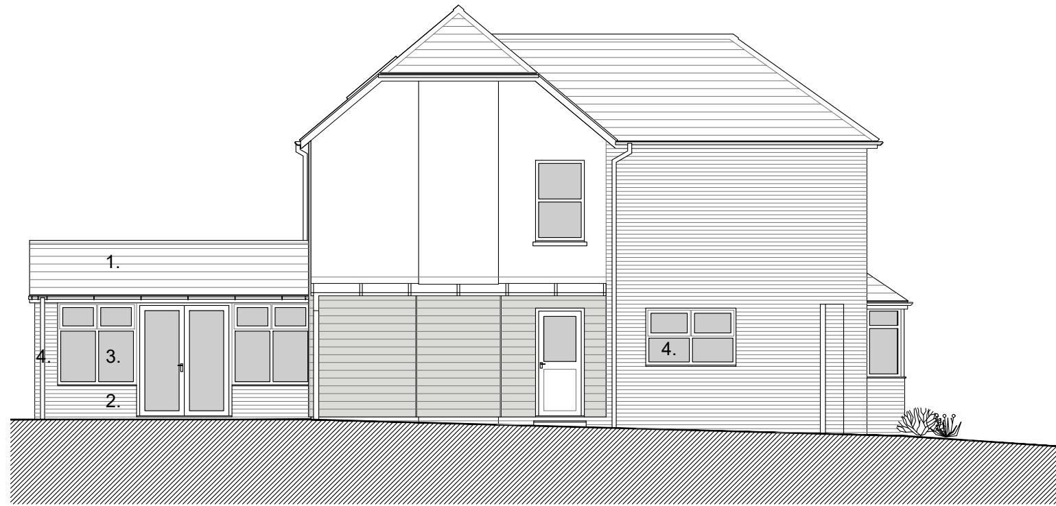
Side (south east) elevations

Contractors to check all dimensions on site. Discrepancies to be reported to the supervising officer before proceeding. Scale for planning purposes only. Drawing to be read in conjunction with all construction details, specification of works and all relevant consultant's drawings. This drawing is copyright of Space Architects UK Ltd.