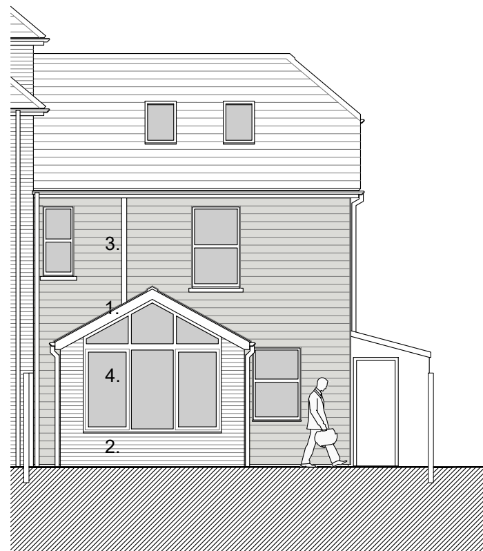
Rear (south west) elevation