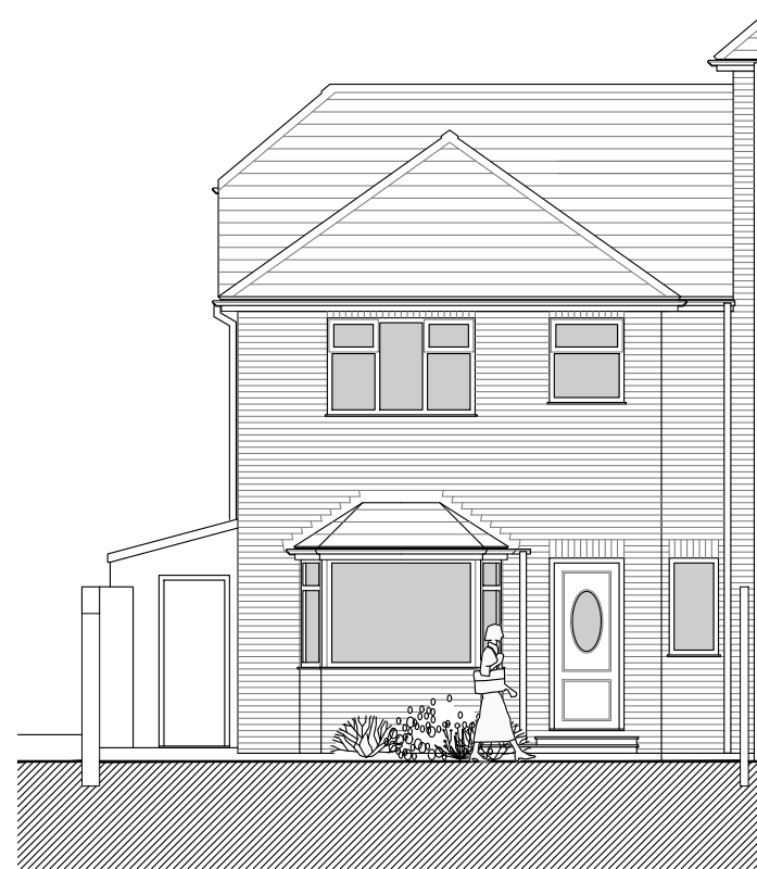
Front (north east) elevation