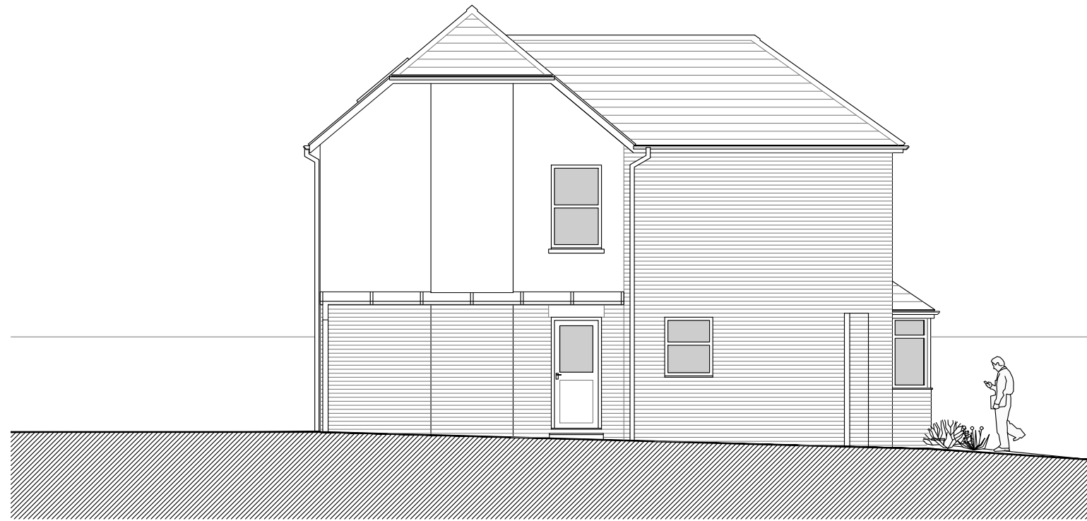
Side (south east) elevations

Contractors to check all dimensions on site. Discrepancies to be reported to the supervising officer before proceeding. Scale for planning purposes only. Drawing to be read in conjunction with all construction details, specification of works and all relevant consultant's drawings. This drawing is copyright of Space Architects UK Ltd.