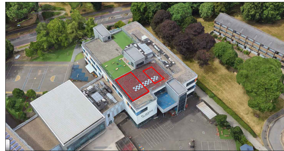
ASHP Enclosure & Packaged Plantroom Location