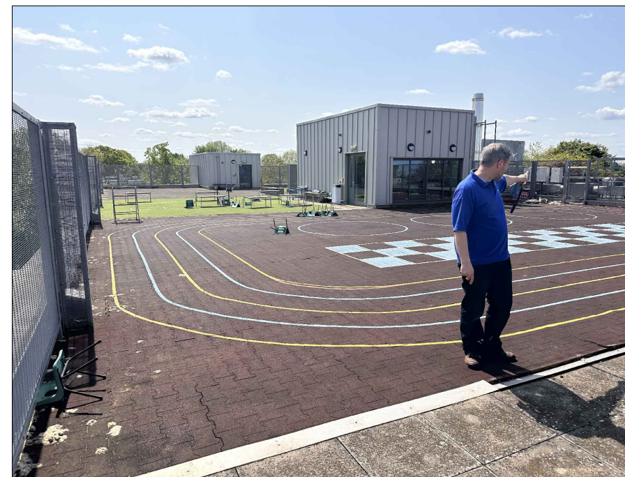
ASHP Enclosure Location