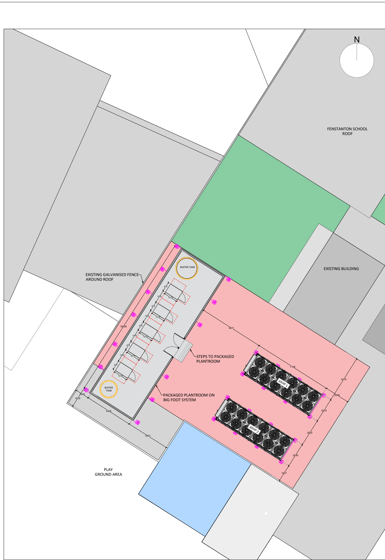
Proposed Site Layout Scale 1:200