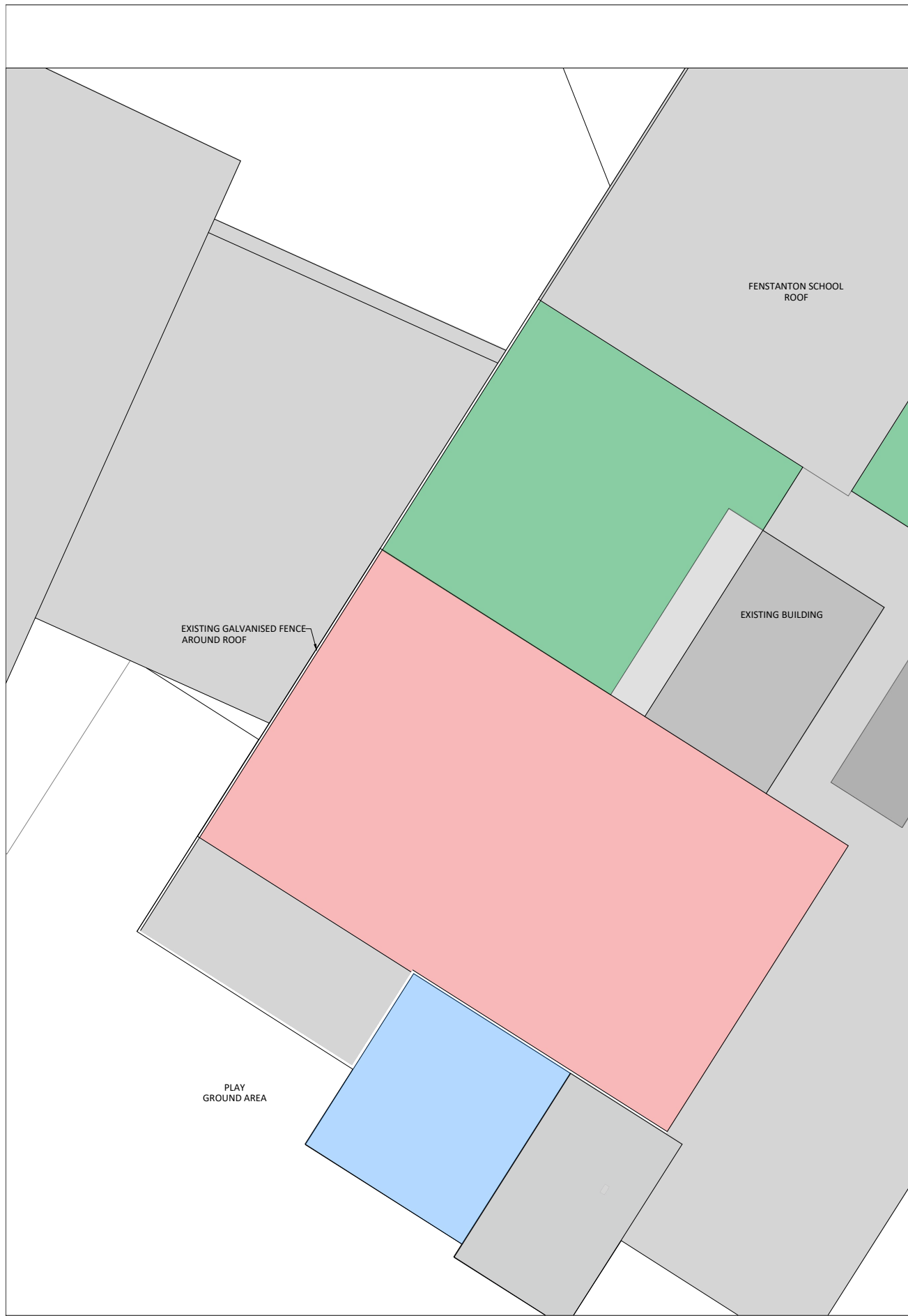
Existing Site Layout Scale 1:200