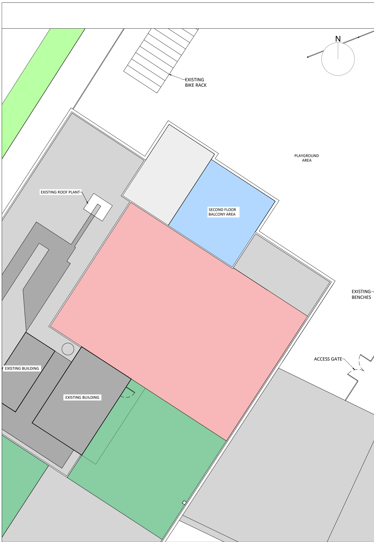
Existing Site Layout Scale 1:200

ALL WORKS ARE TO BE CARRIED OUT IN ACCORDANCE WITH THE LATEST BRITISH STANDARDS AND CODES OF PRACTICE UNLESS SPECIFICALLY DIRECTED OTHERWISE IN THE SPECIFICATION.