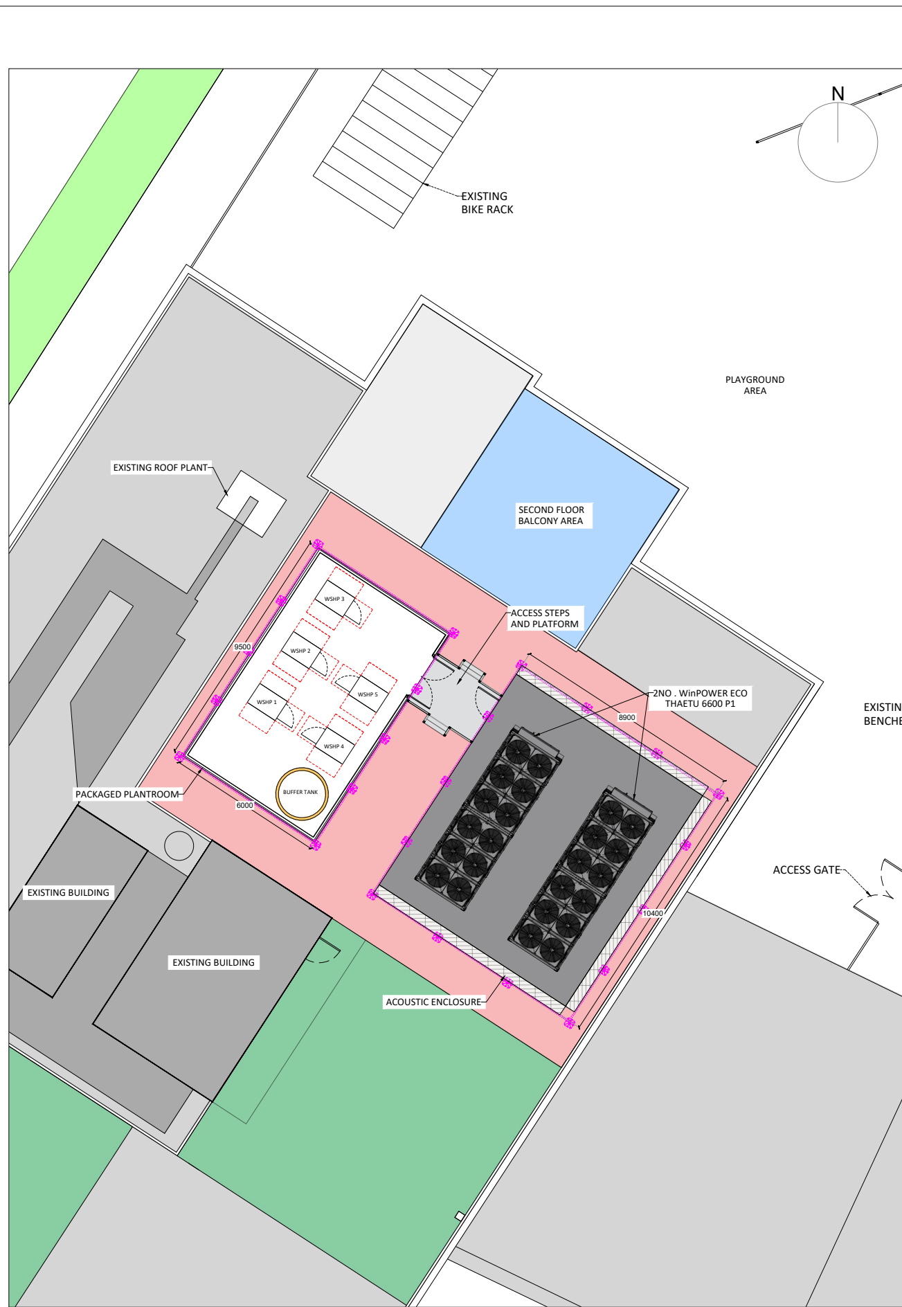
Proposed Site Layout Scale 1:200