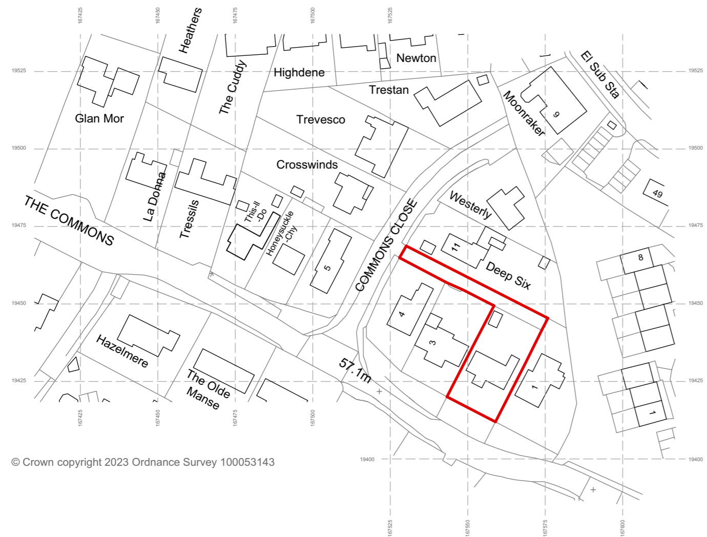
LOCATION PLAN 1.1250