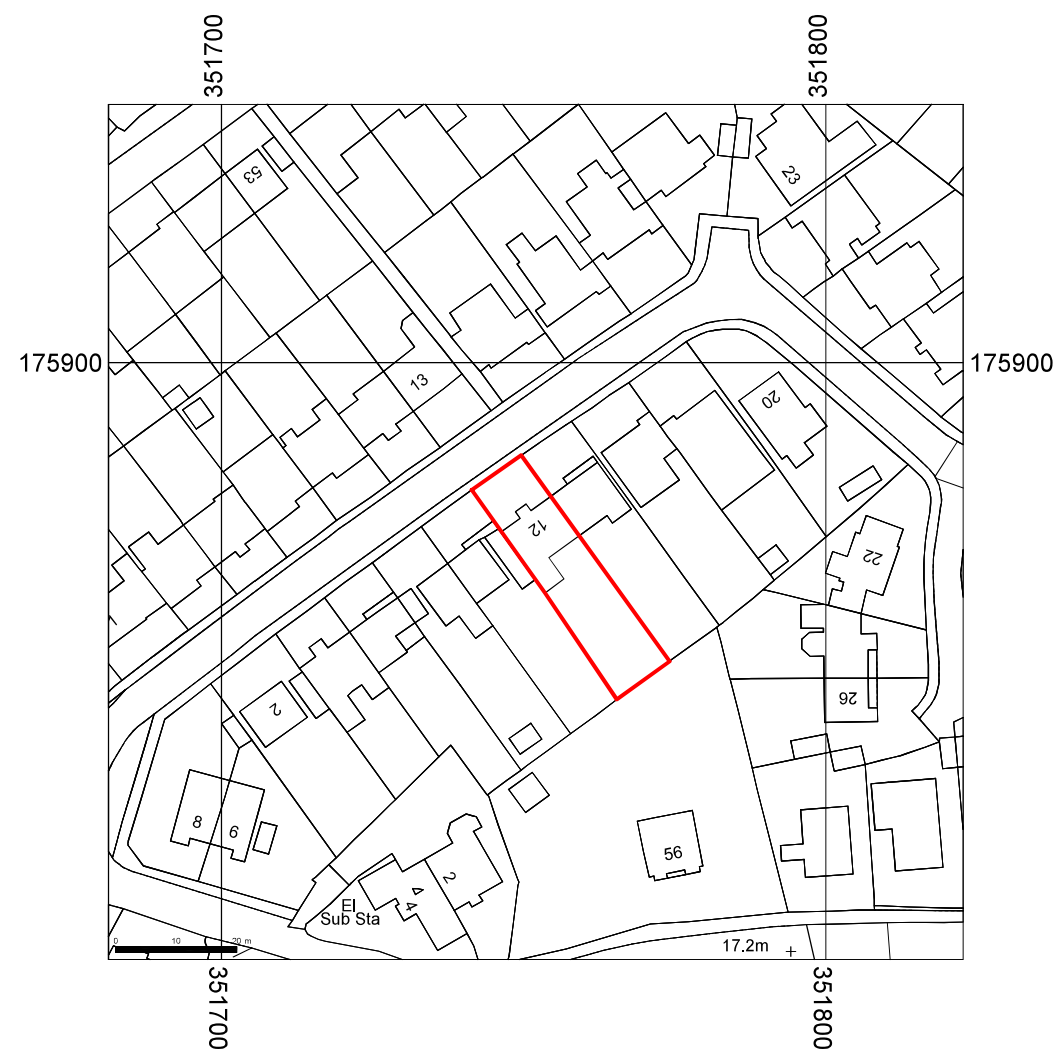
Existing Location Plan (1:1250)

This drawing is copyright and must not be reproduced in any form without written consent of Enhance Architecture Ltd.