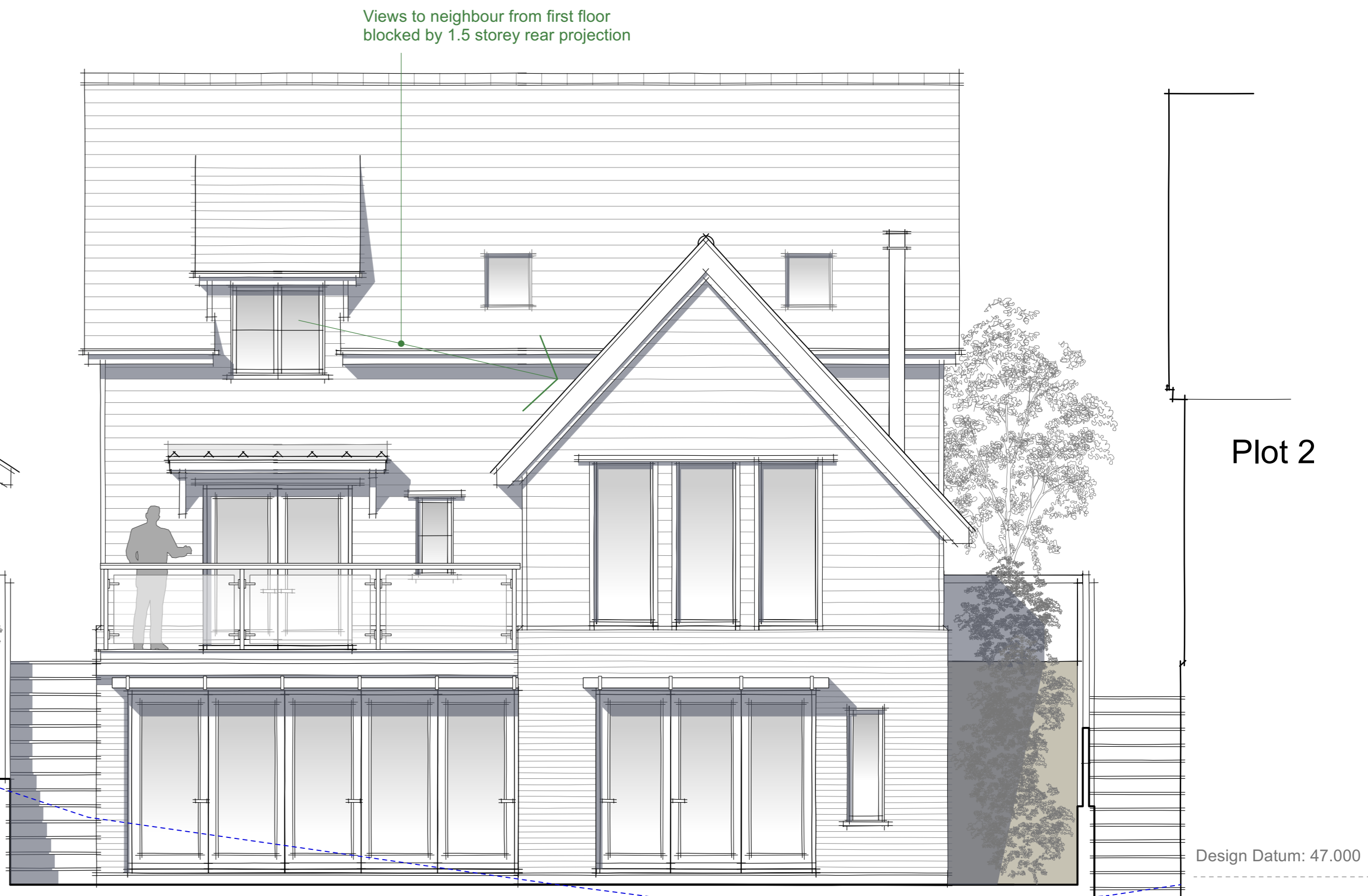
Rear / South Elevation