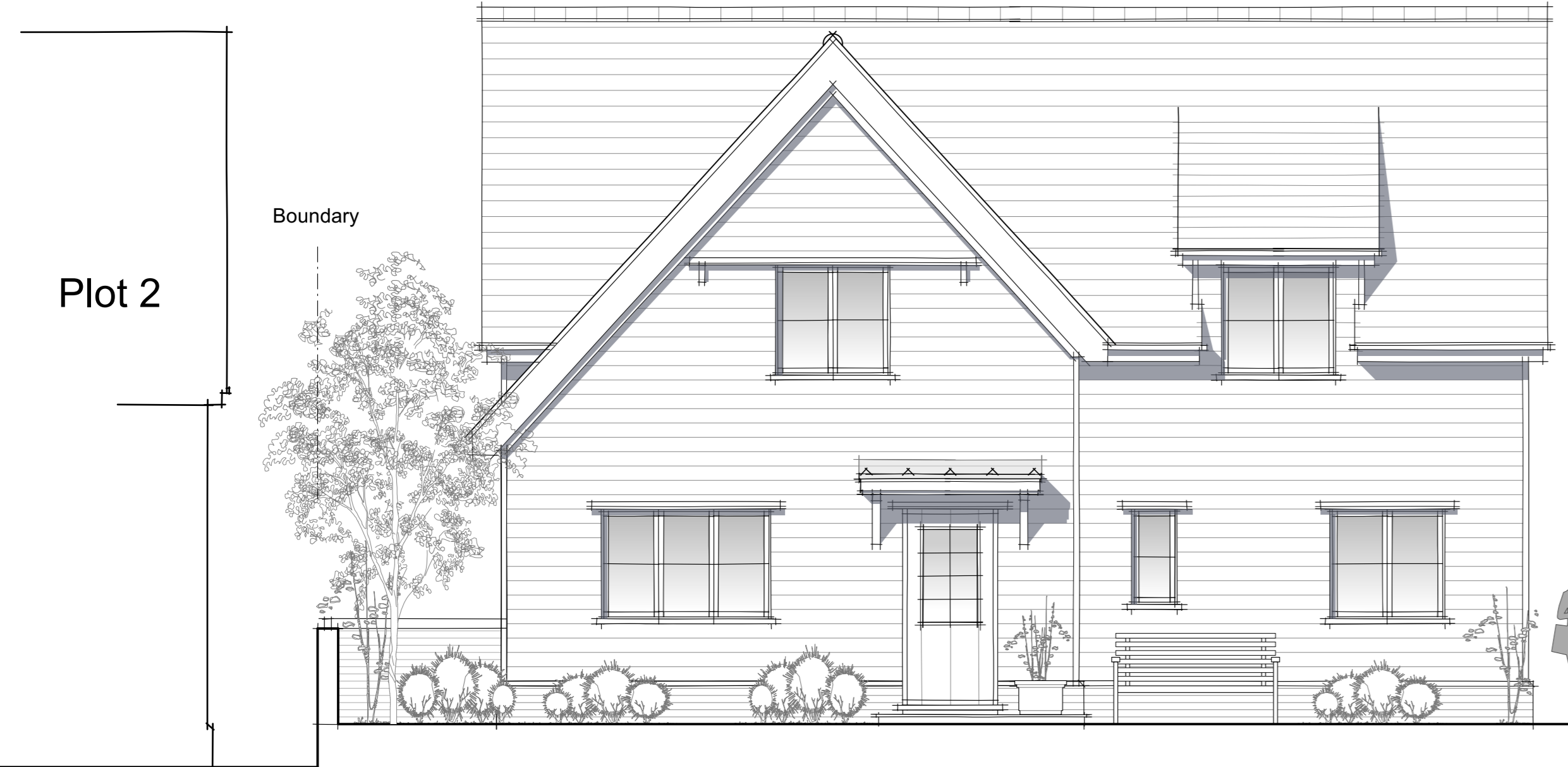
Front / North Elevation