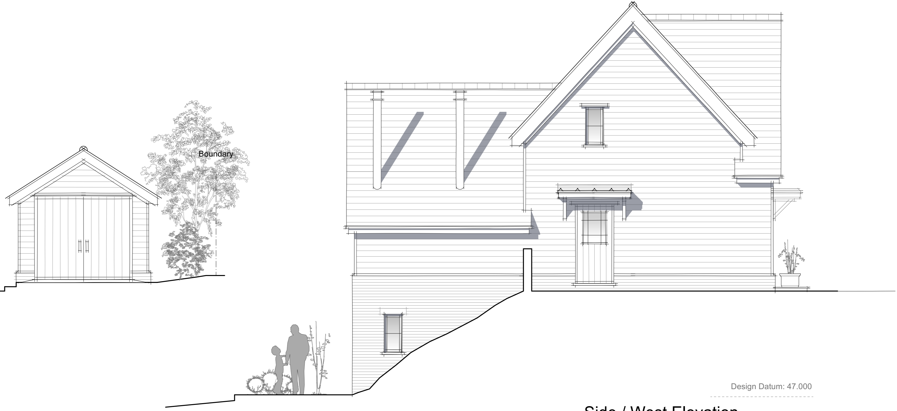
Side / West Elevation