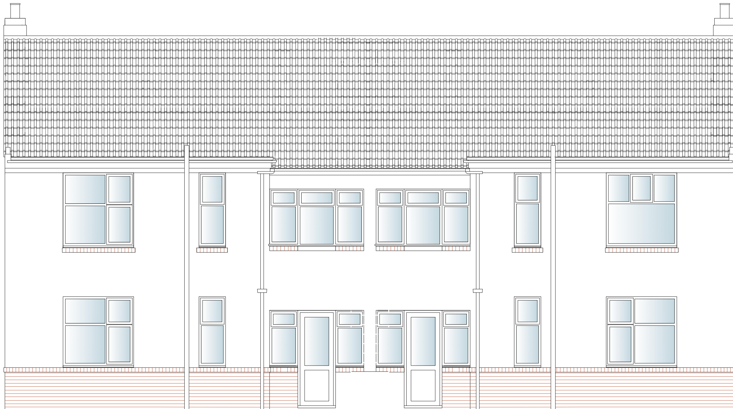
Existing Rear Elevation - South