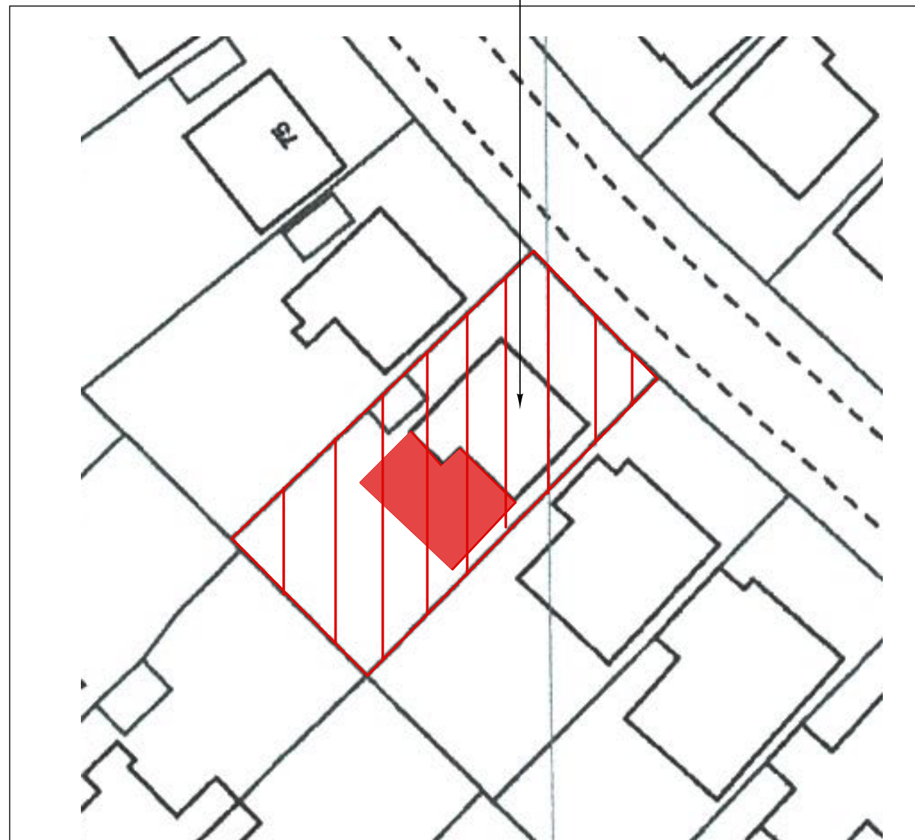
BLOCK PLAN ... 1 : 250

The site outlined in red is owned by the applicant