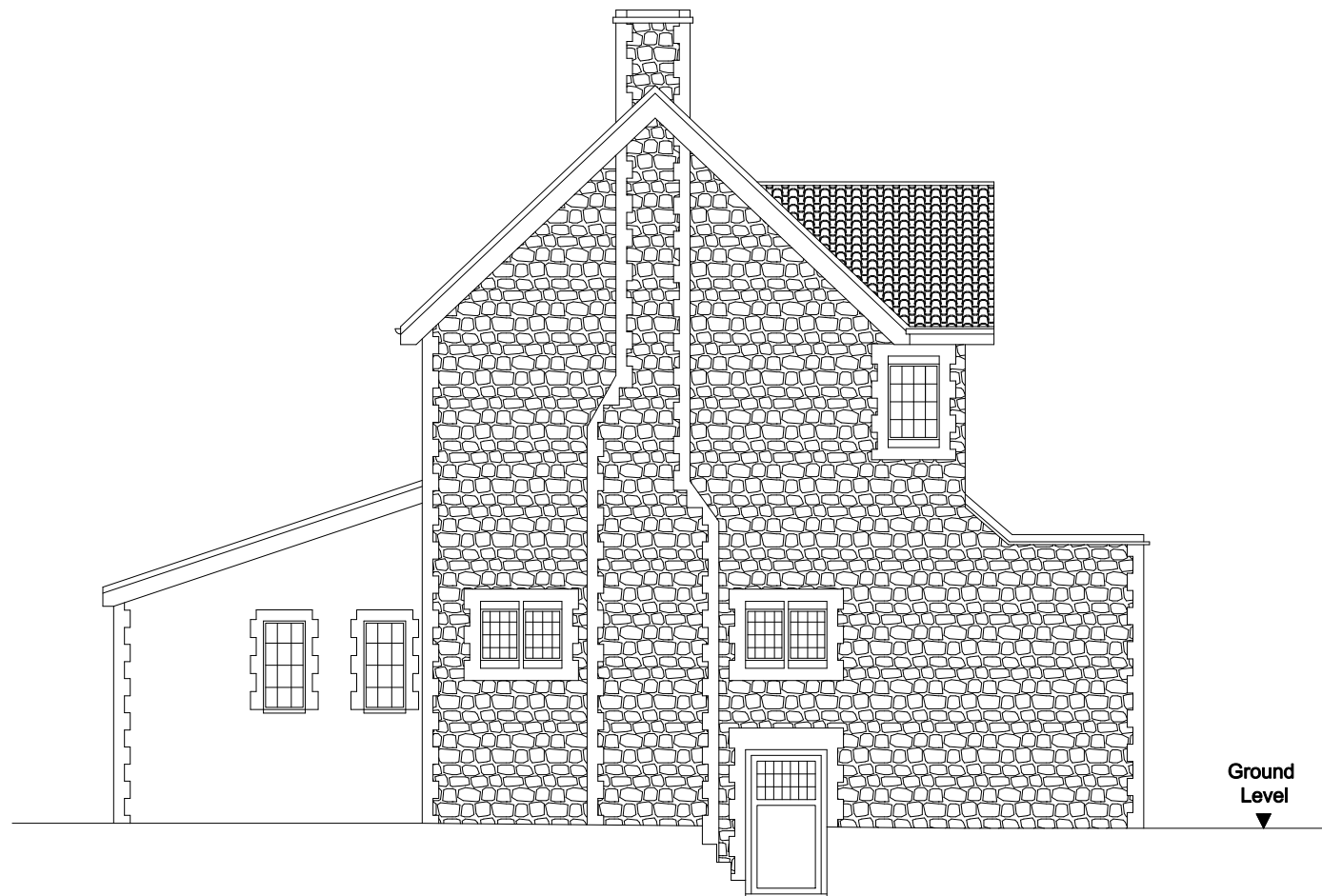
Existing Side A

NOTES:- RESPONSIBILITY IS NOT ACCEPTED FOR ERRORS MADE BY OTHERS IN SCALING FROM THIS DRAWING. ALL CONSTRUCTION INFORMATION SHOULD BE TAKEN FROM FIGURED DIMENSIONS ONLY. ALL DIMENSIONS ARE IN MILLIMETERS