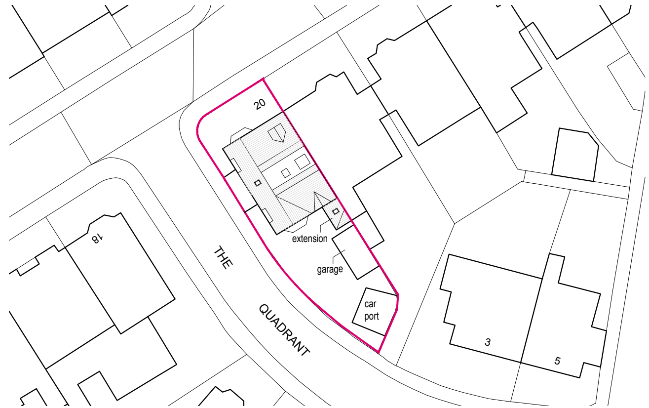
2 EXISTING BLOCK PLAN (10)01 1:500