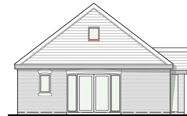
Side Elevation (facing south)