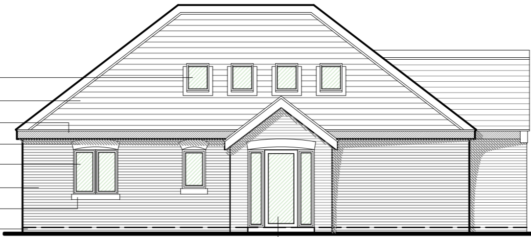
Front Elevation (facing Hemming Street)