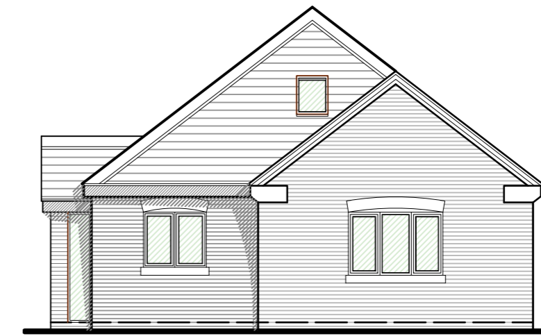
Side Elevation (facing Greatfield Road)