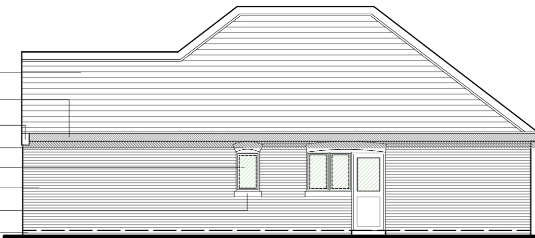
Rear Elevation (facing West)