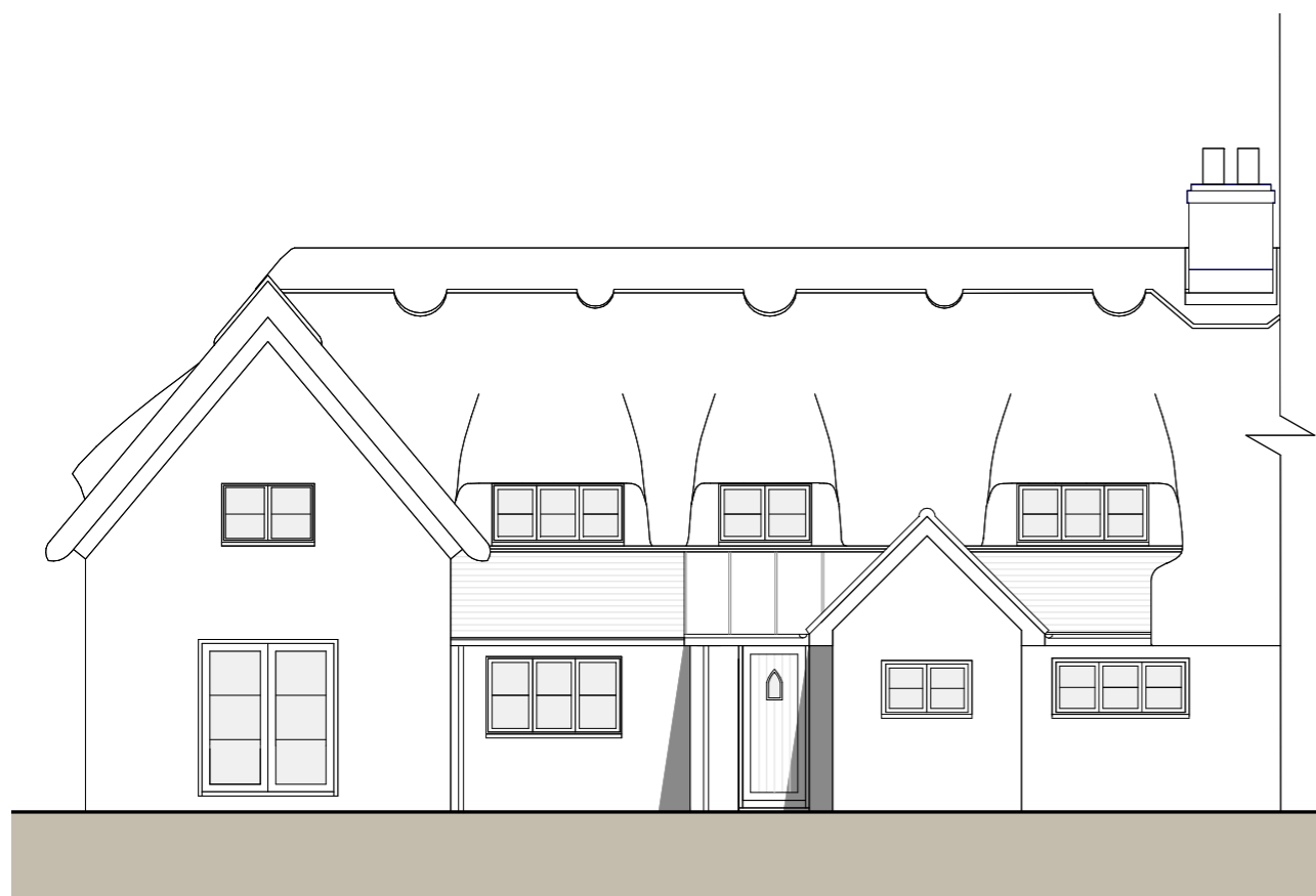
Rear Elevation (South)