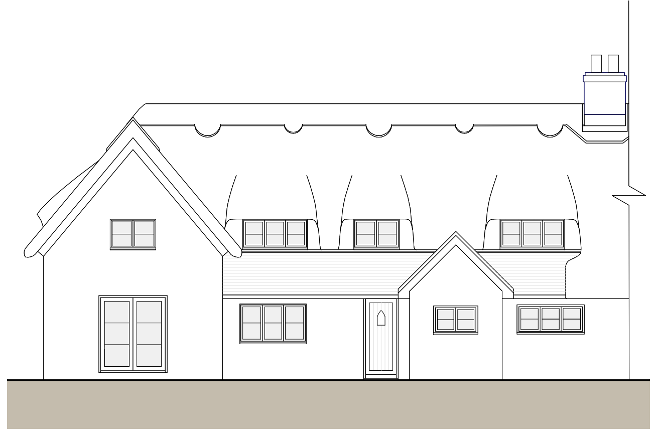
Rear Elevation (South)