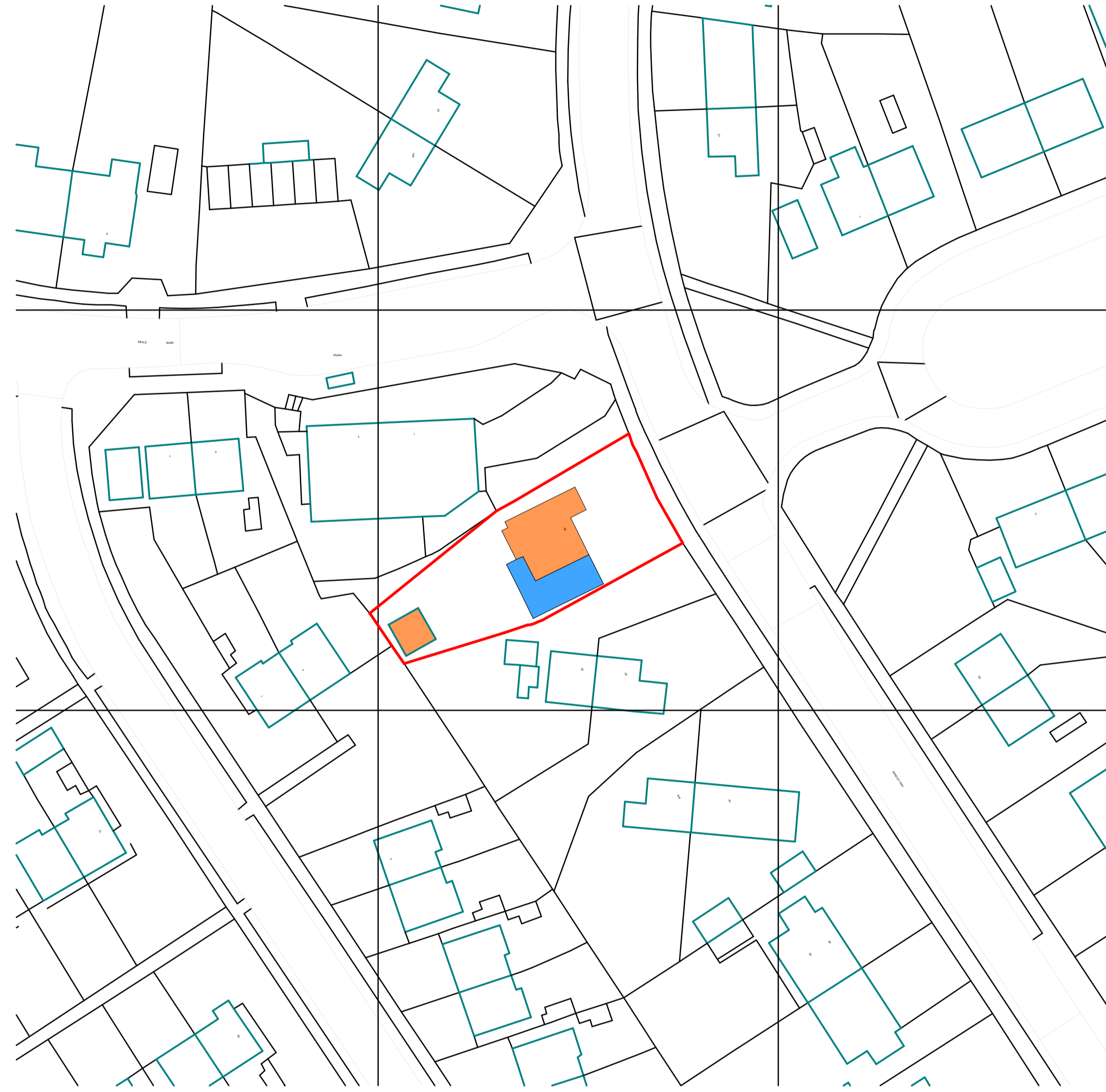
Proposed Site Layout